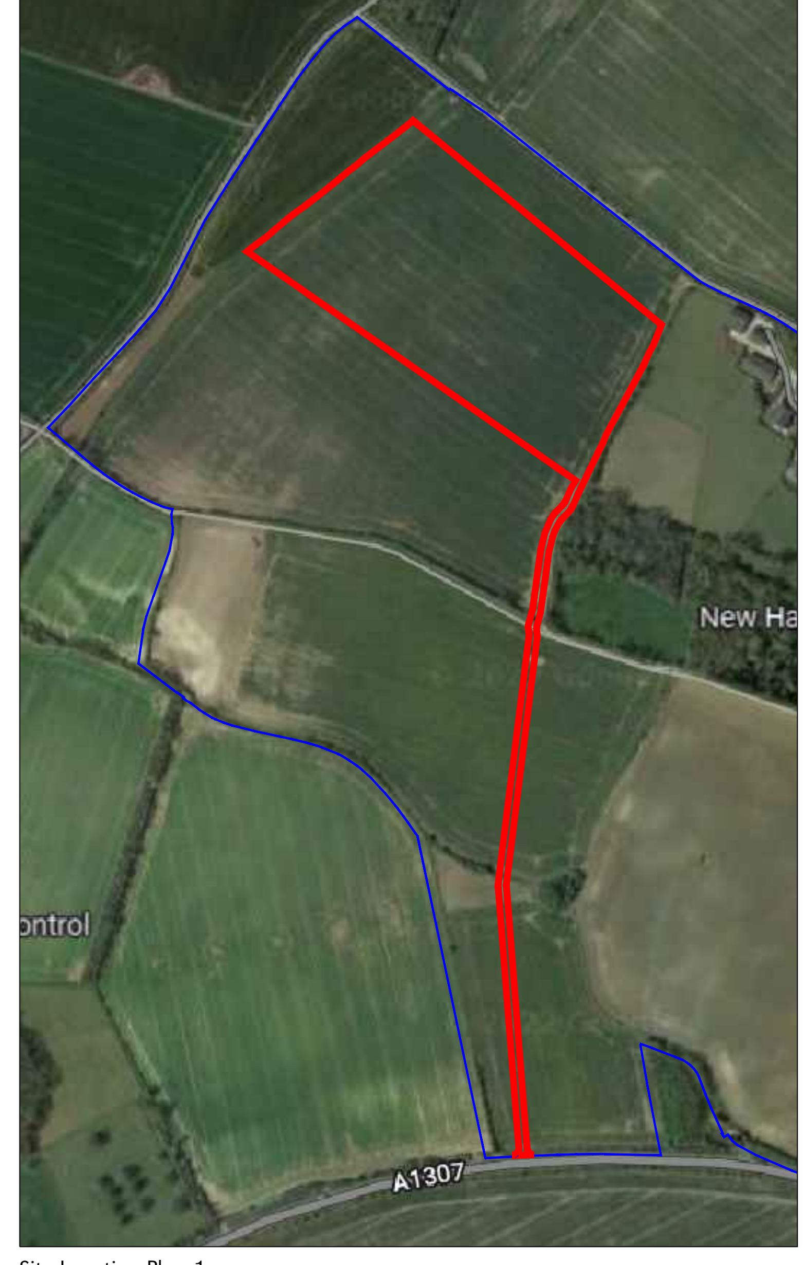
Site Location Plan 1