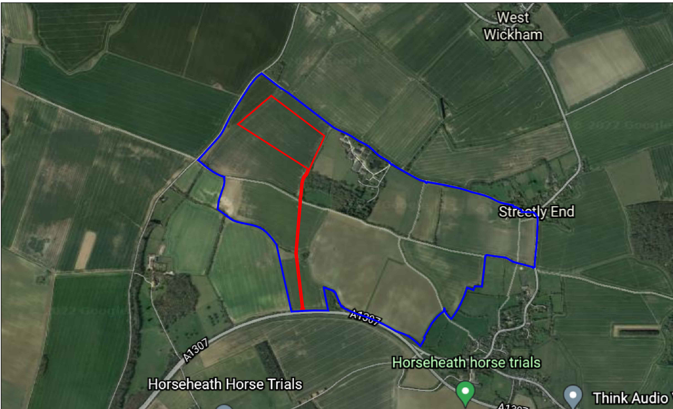
Site Location Plan 2 Not To Scale