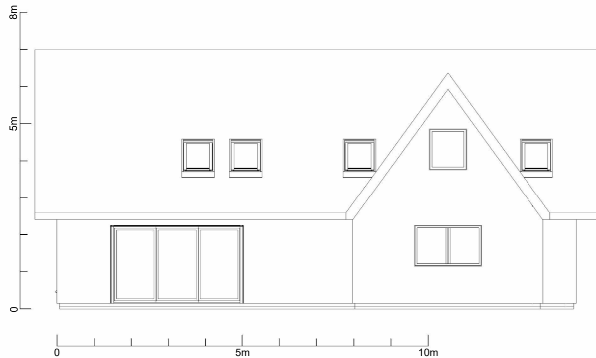
4 East (Rear)