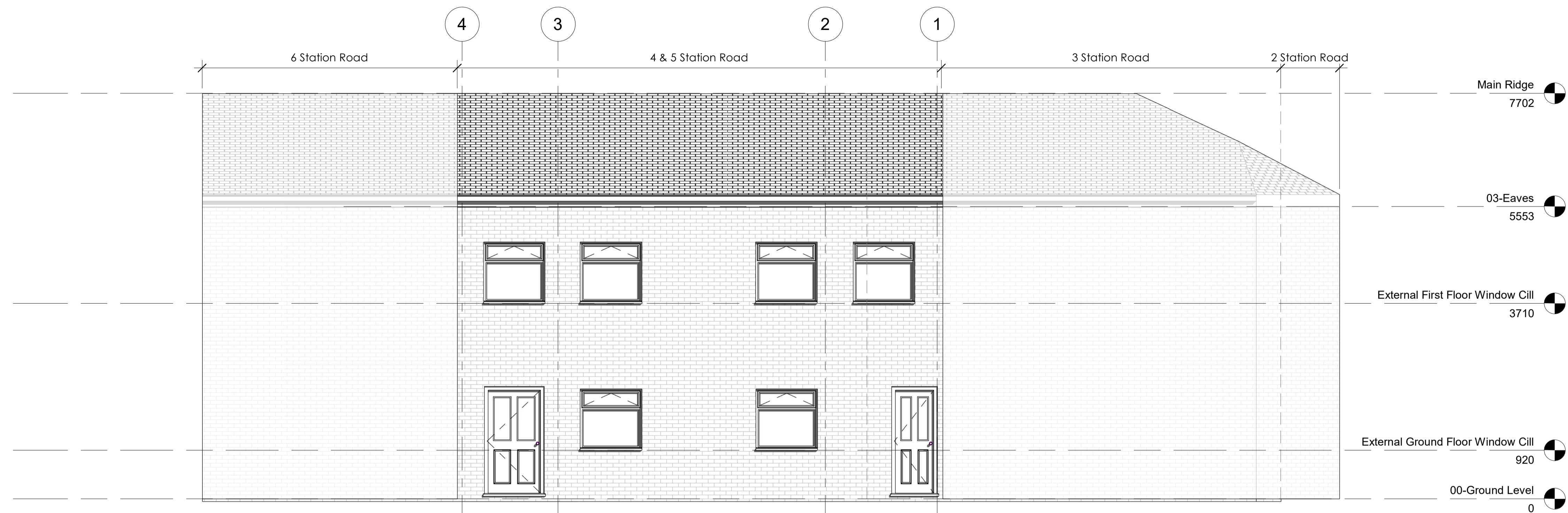
1 Elevation Front 1 : 50