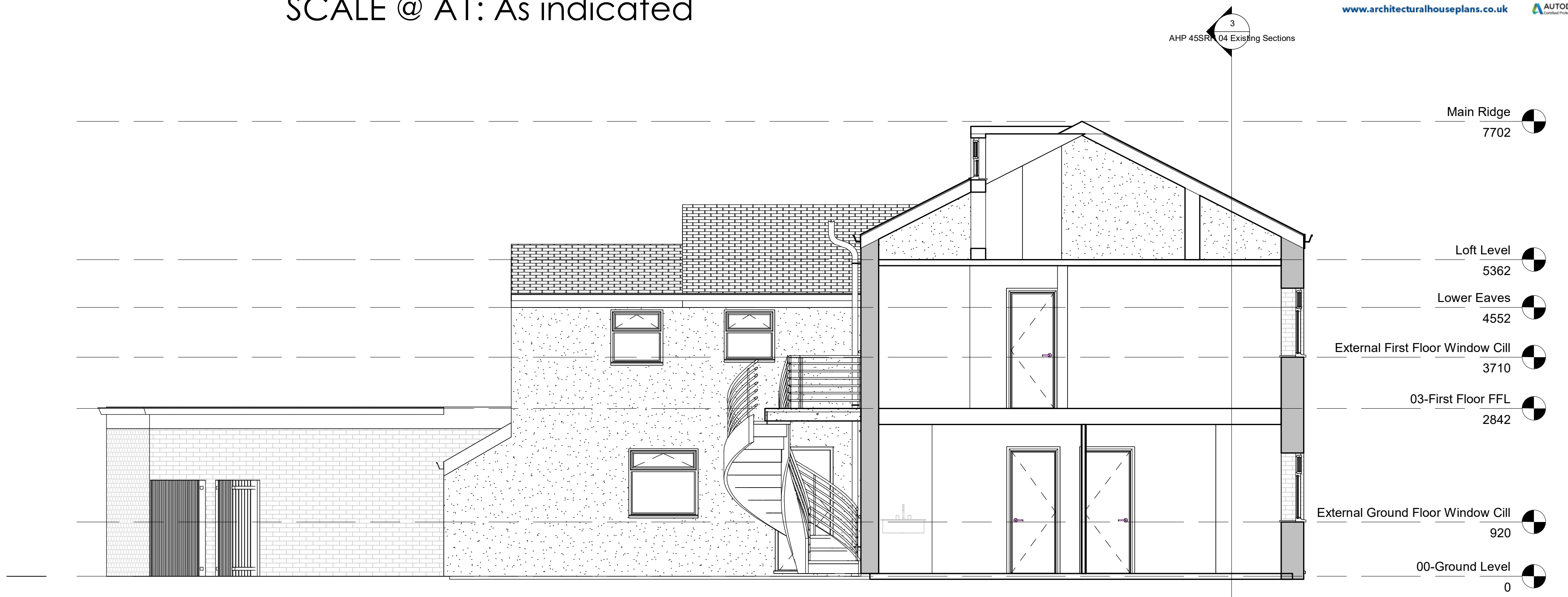
1 Elevation Courtyard 1 1 : 50