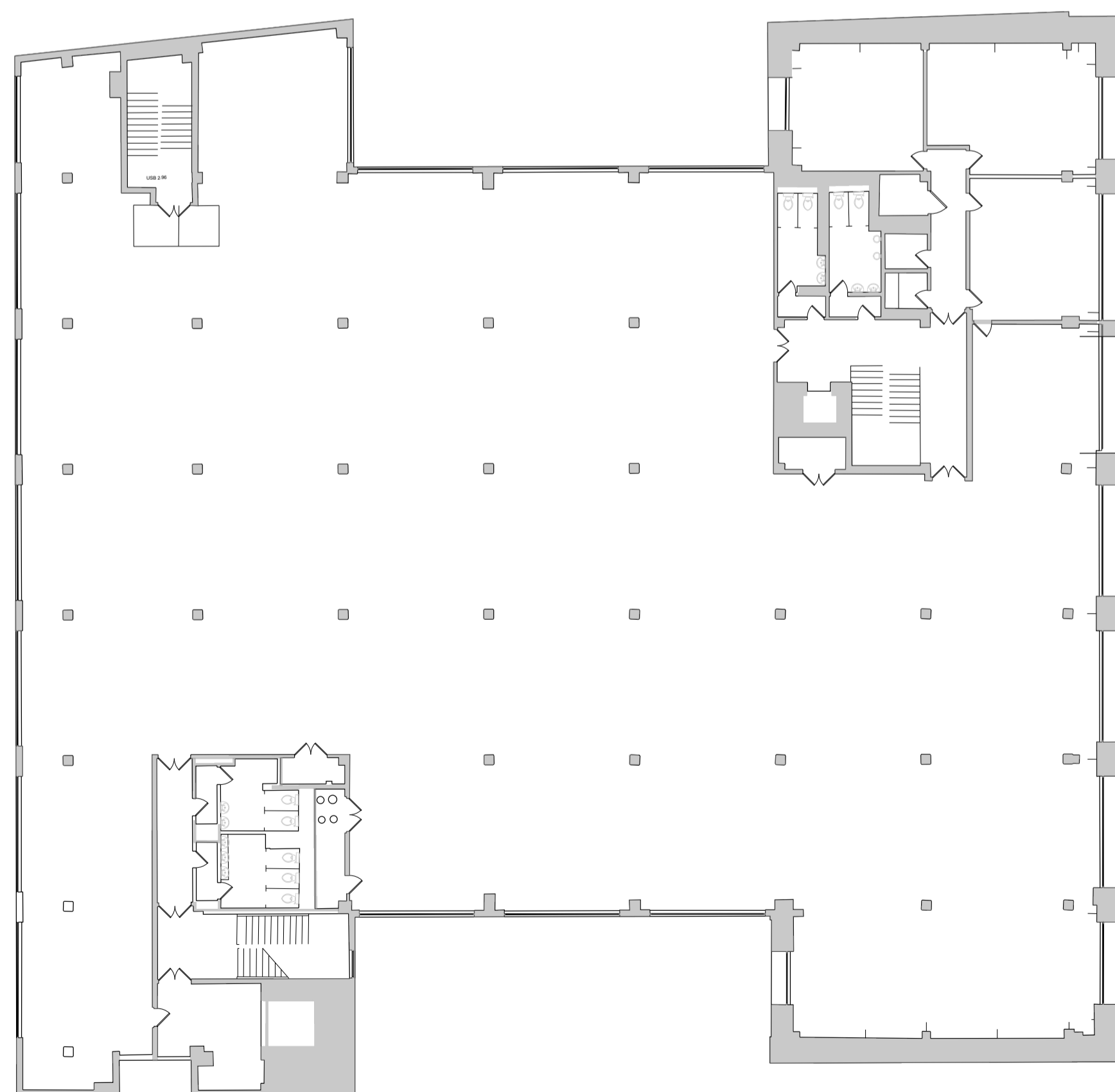
EXISTING SECOND FLOOR PLAN