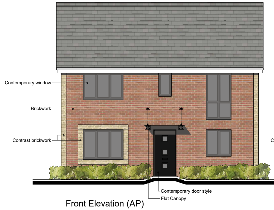
Front Elevation (AP)