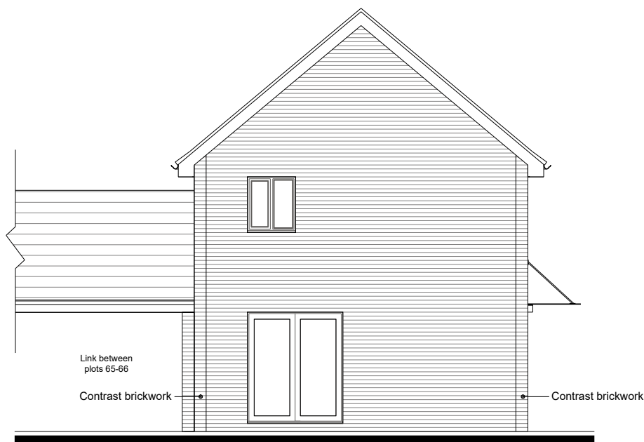
Side Elevation (AP) Right