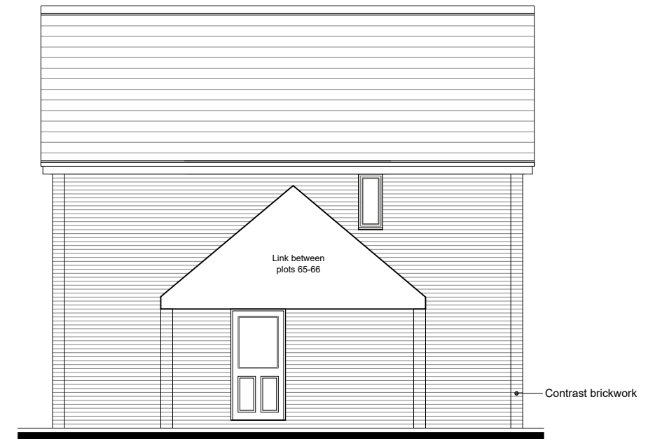
Rear Elevation (AP)