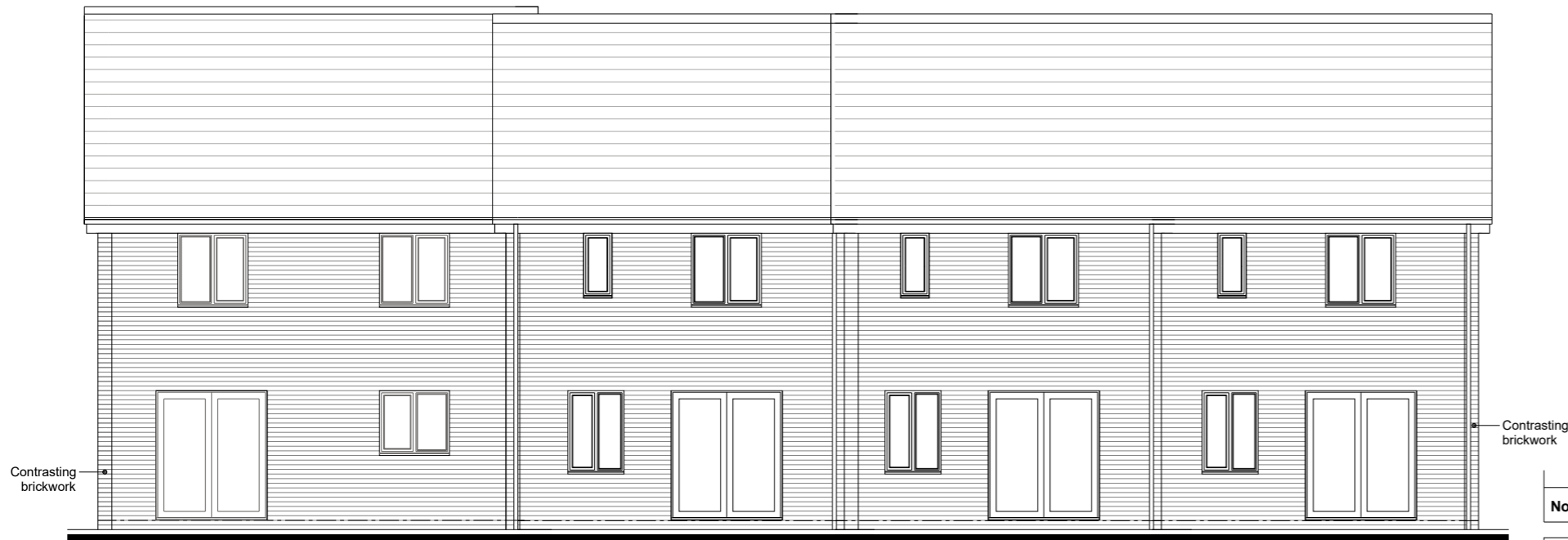
Rear Elevation (AP)