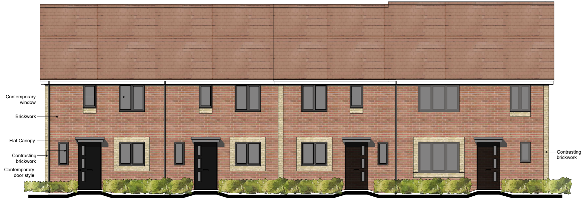
Front Elevation (H)