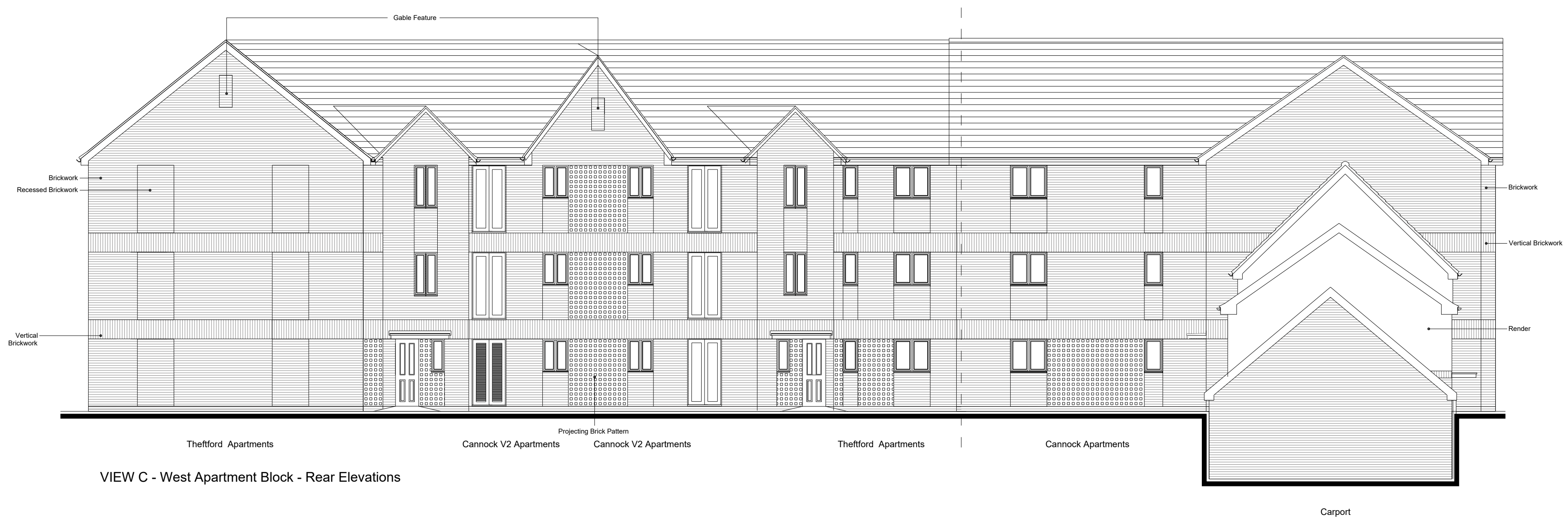
VIEW C - West Apartment Block - Rear Elevations