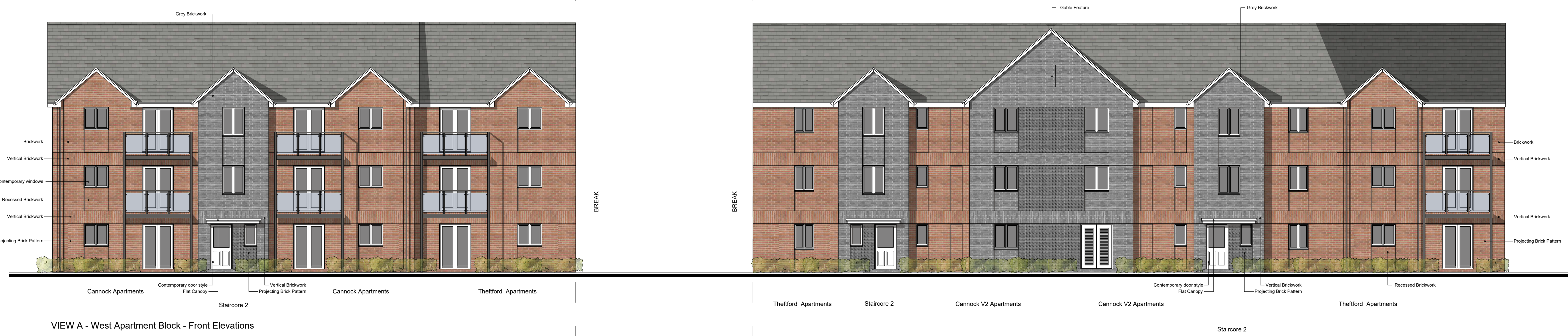
VIEW A - West Apartment Block - Front Elevations