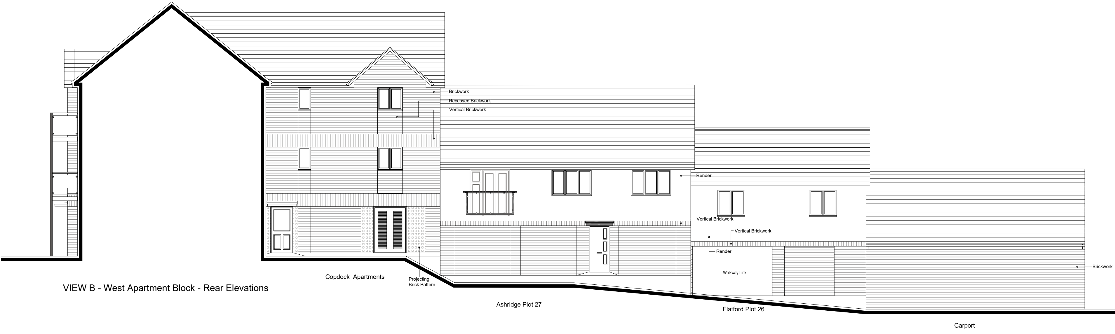
VIEW B - West Apartment Block - Rear Elevations