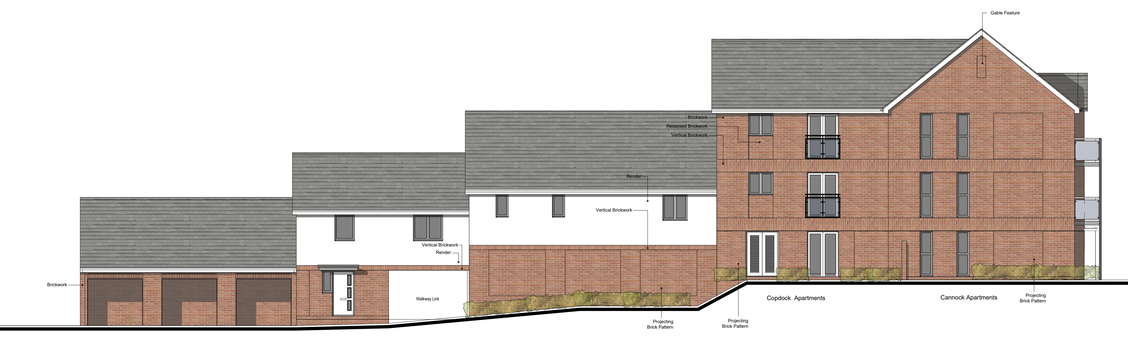
VIEW D - West Apartment Block - Side Elevations