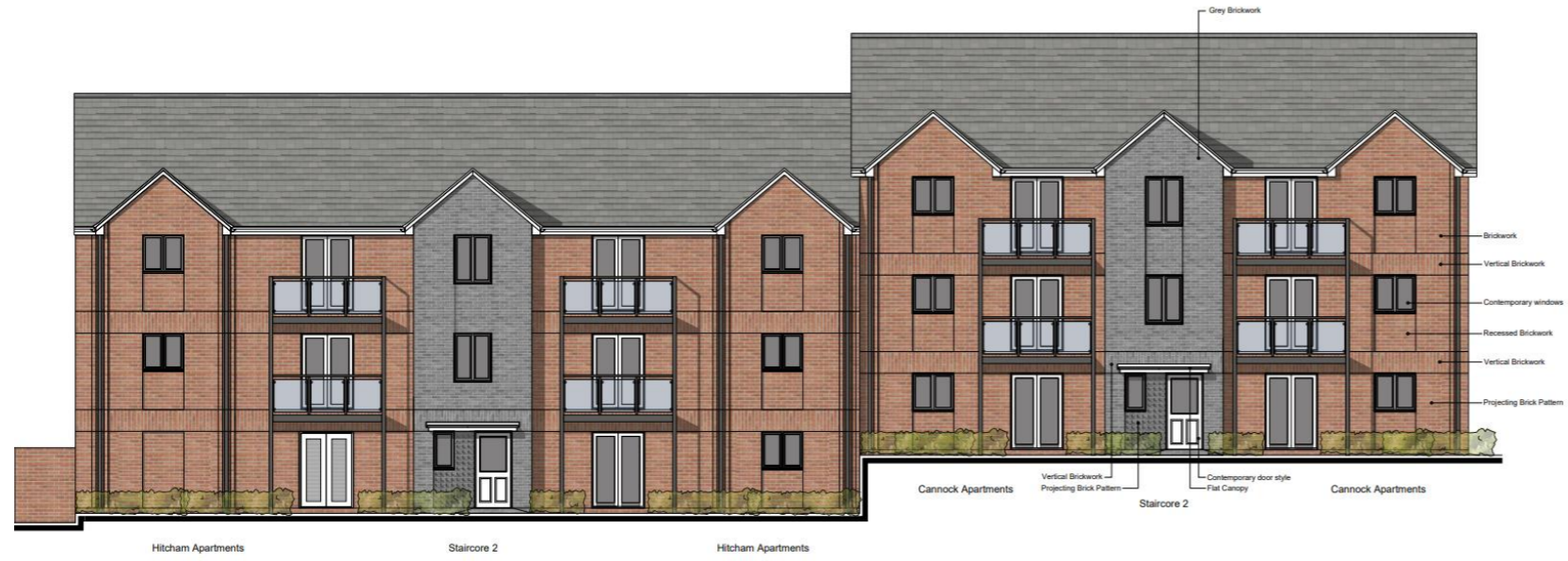
VIEW A - East Apartment Block - Front Elevations