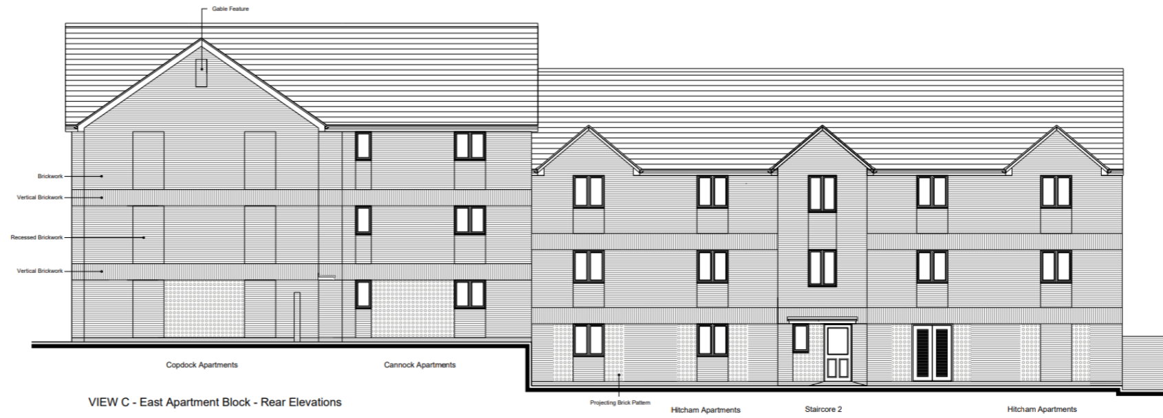
VIEW C - East Apartment Block - Rear Elevations