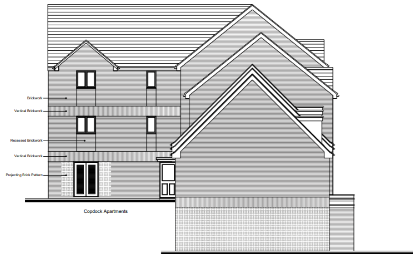
VIEW D - East Apartment Block - Side/Rear Elevations