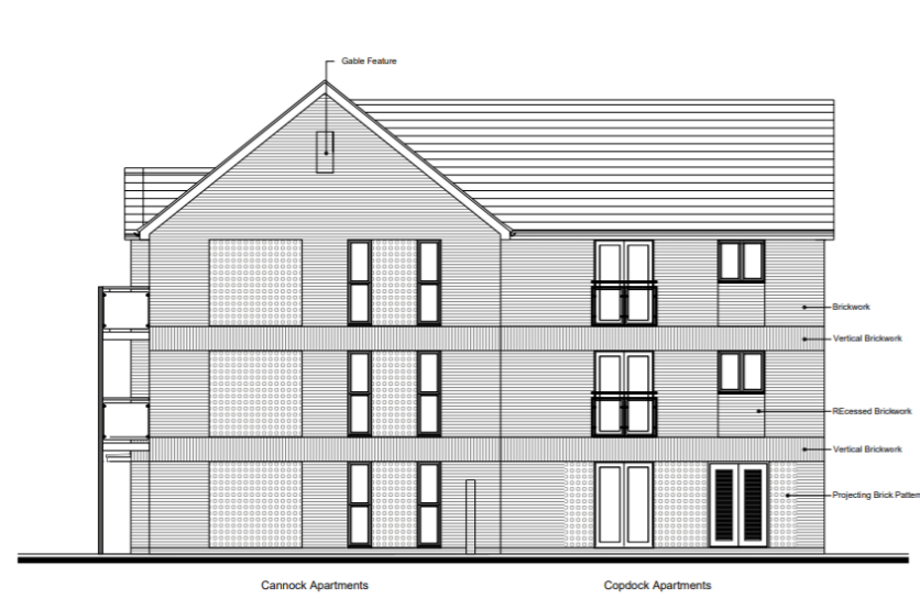
VIEW B - East Apartment Block - Side Elevations