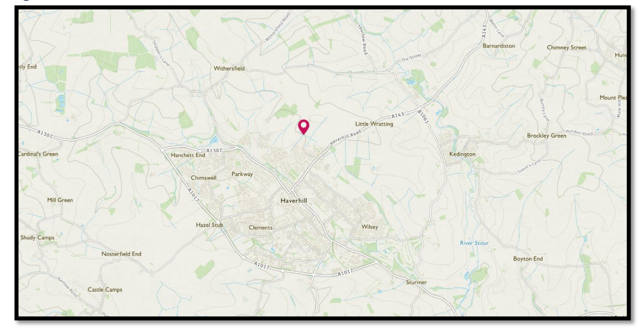
Figure 1: Location of site, centred on red marker