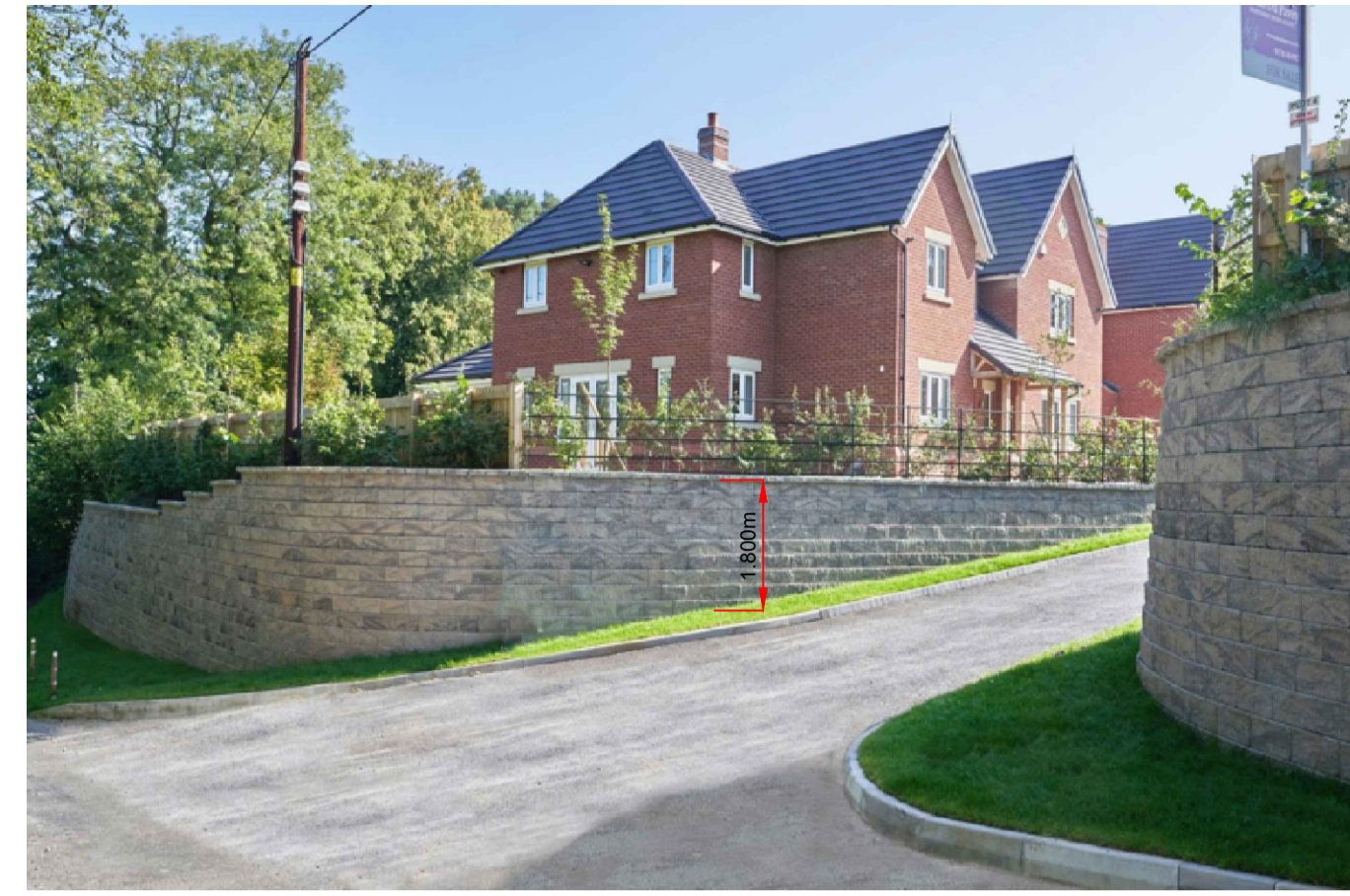
Proposed Tobermore retaining wall example