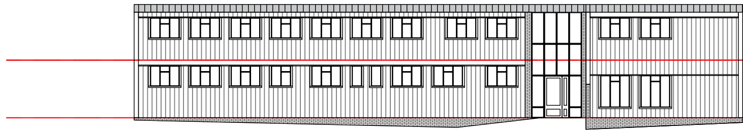
EXISTING SOUTH EAST FACADE