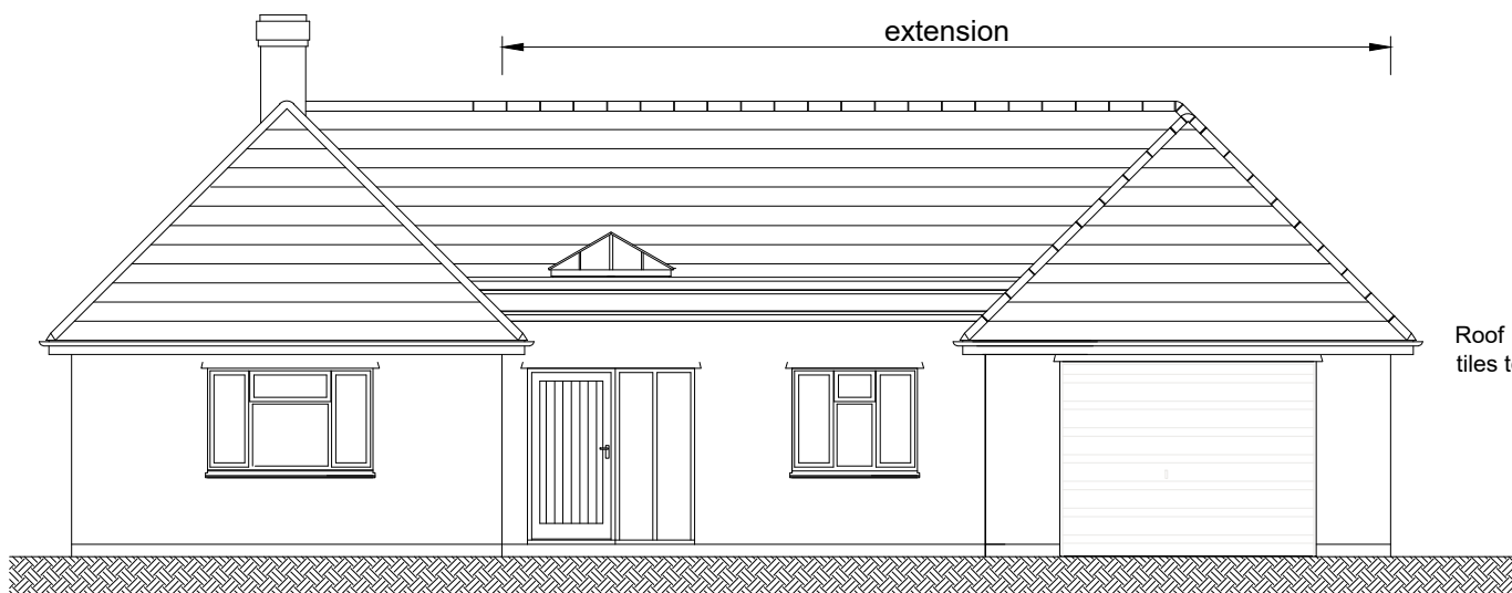
15765 Proposed Front Elevation

ALL WORKING DIMENSIONS TO BE CHECKED ON SITE. FIGURED DIMENSIONS TO BE TAKEN IN PREFERENCE TO SCALED DIMENSIONS. ANY DISCREPANCIES BETWEEN DRAWINGS OF DIFFERING SCALES AND BETWEEN DRAWINGS AND SPECIFICATION WHERE APPROPRIATE TO BE NOTIFIED TO SUPERVISING OFFICER FOR DECISION. COPYRIGHT RESERVED.