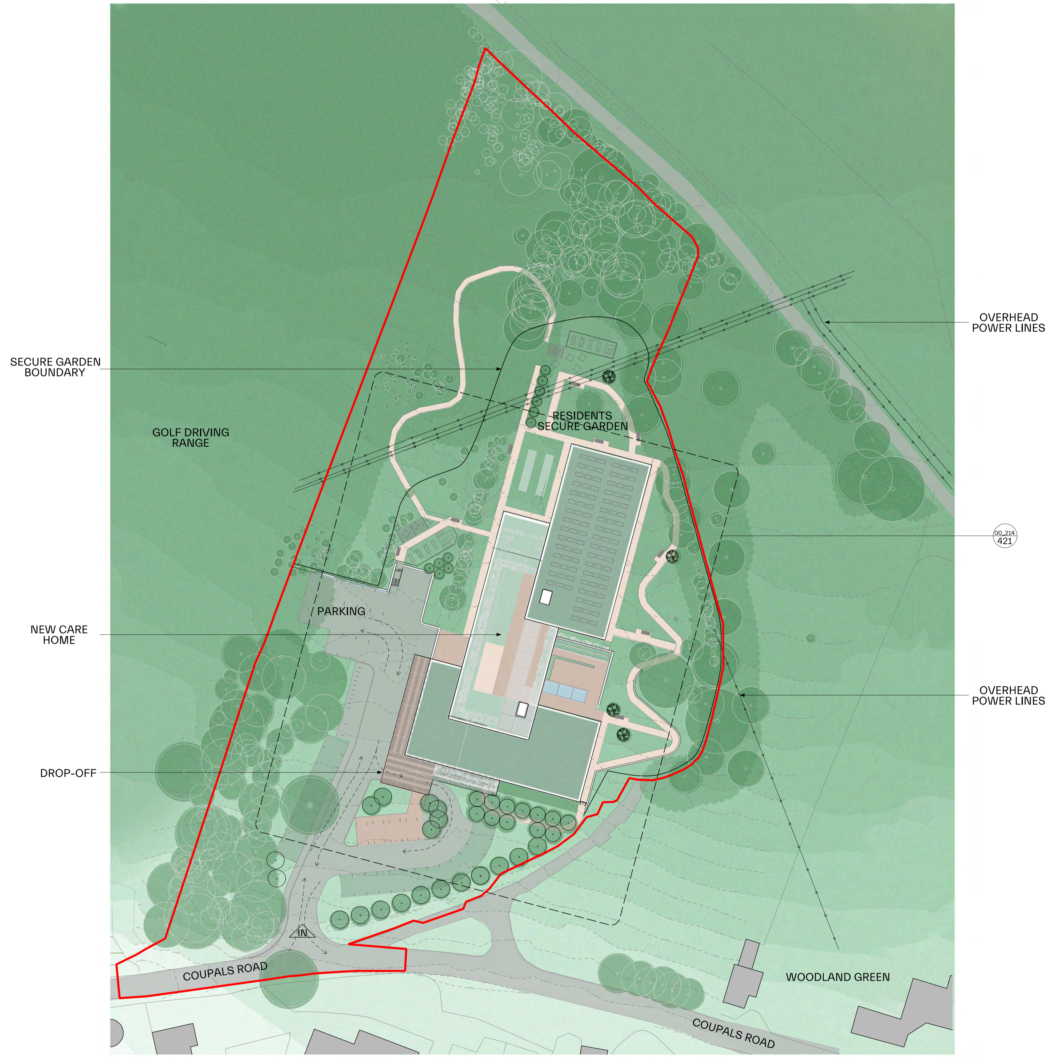
Proposed Site / Block Plan