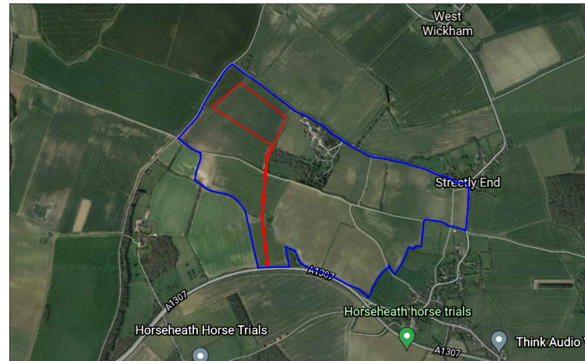
Site Location Plan 2 Not To Scale

This drawing and the works depicted thereon are the copyright of Plandescil Consulting Engineers Ltd. Unauthorised reproduction infringes copyright.