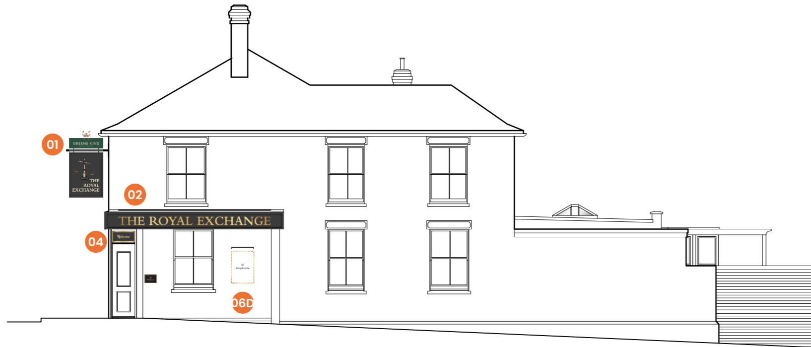
SOUTH-EAST ELEVATION Scale 1:100 @ A3