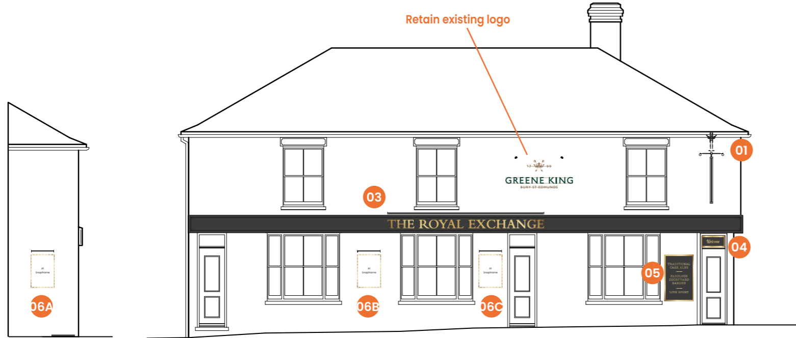
RETURN ELEVATION Scale 1:100 @ A3