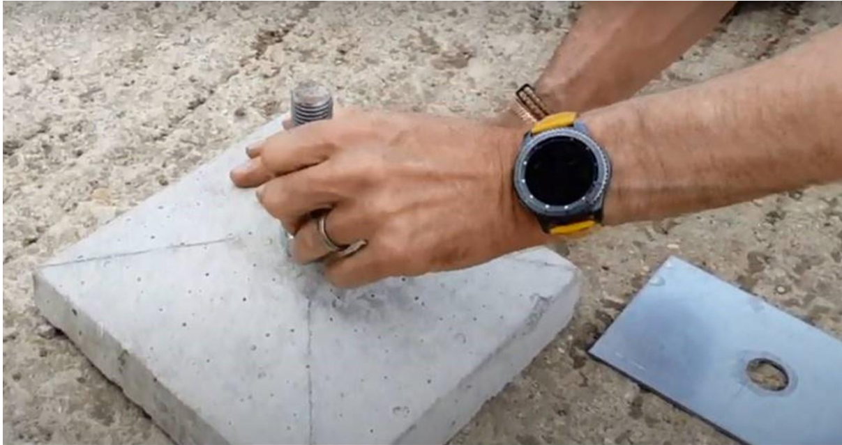
Pad foot for spreading load over ground