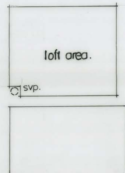
first floor. 1:50.

NOTE. Builder to check all setting out details on site.