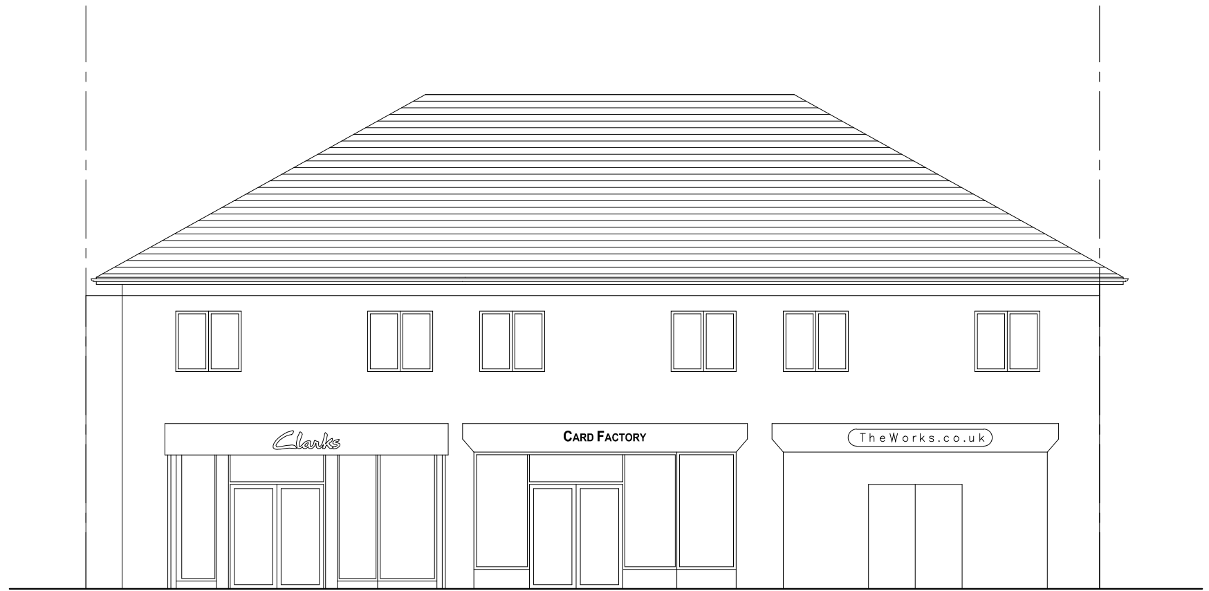
PROPOSED FRONT ELEVATION (AS EXISTING - UNCHANGED)