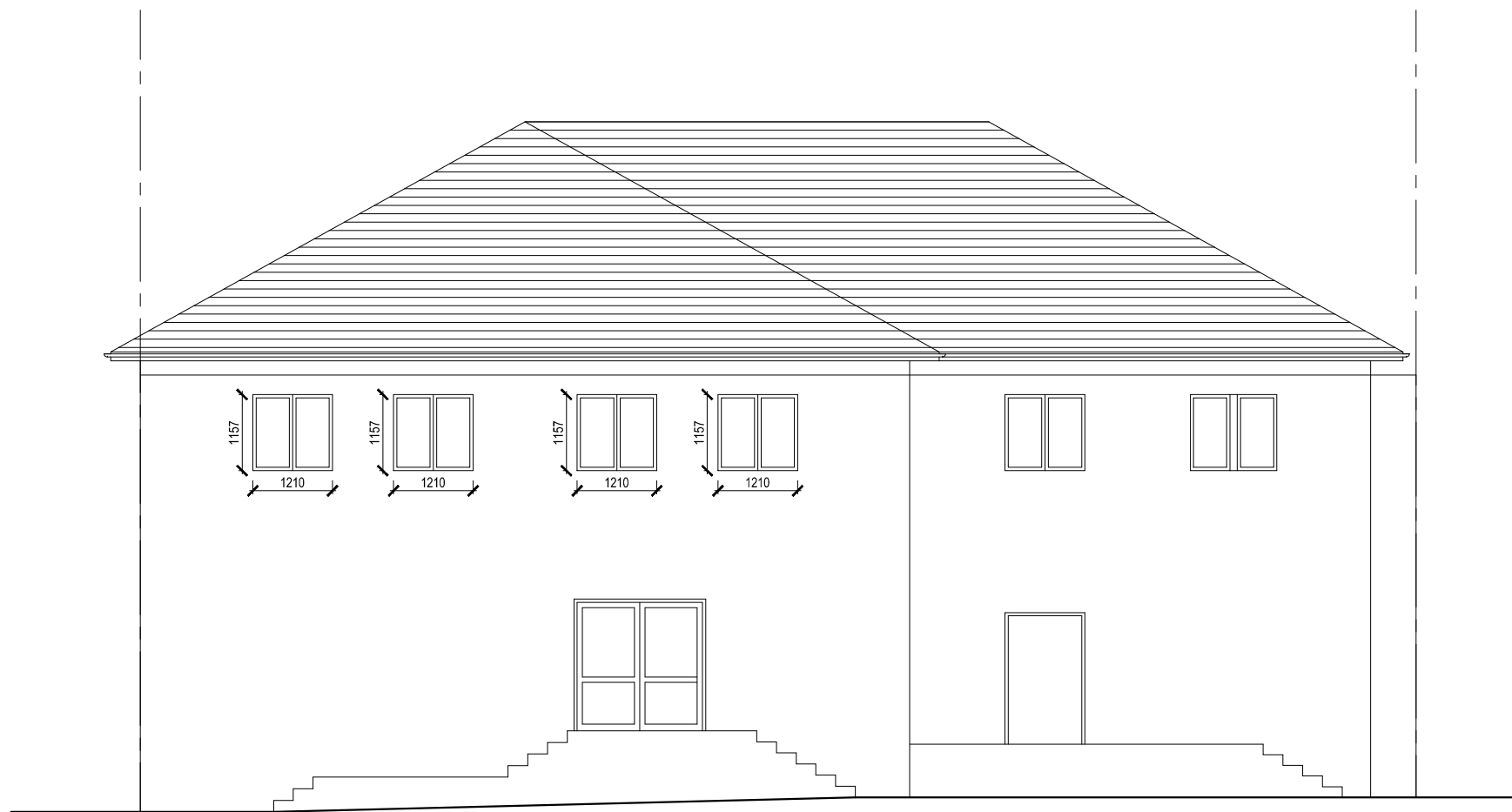
PROPOSED REAR ELEVATION (AS EXISTING - UNCHANGED)