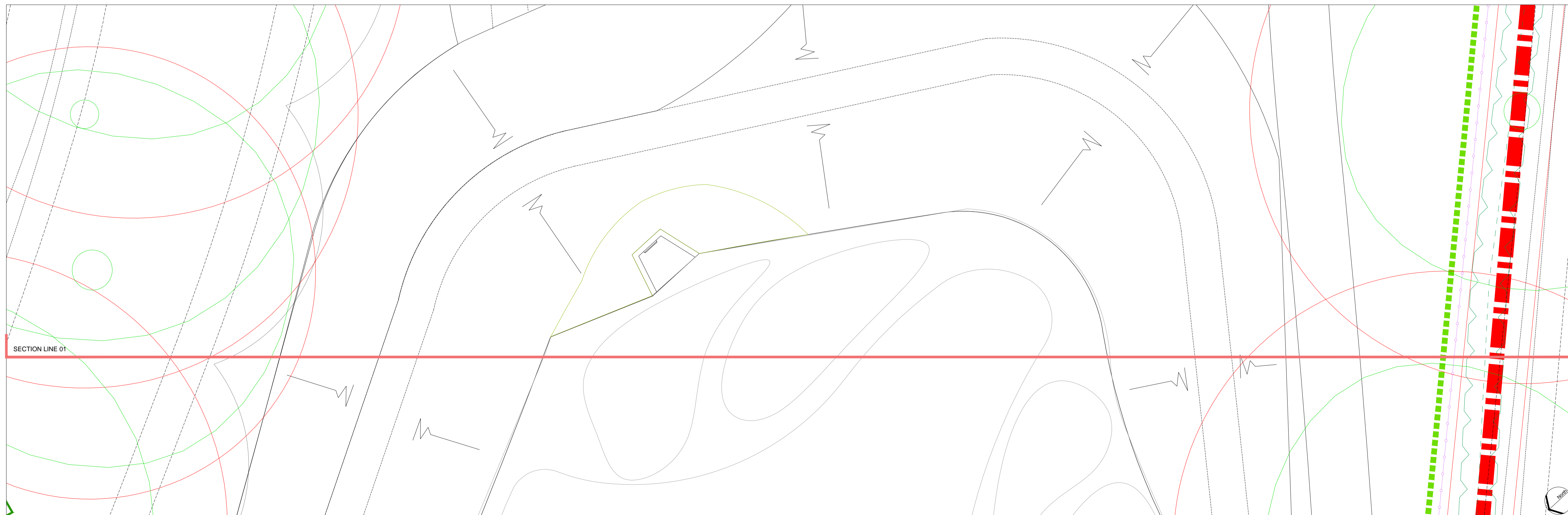
04 PLAN VIEW OF MOUND 501 PLAN VIEW

No dimensions are to be scaled from this drawing. All dimensions are to be checked on site. Area measurements for indicative purposes only.