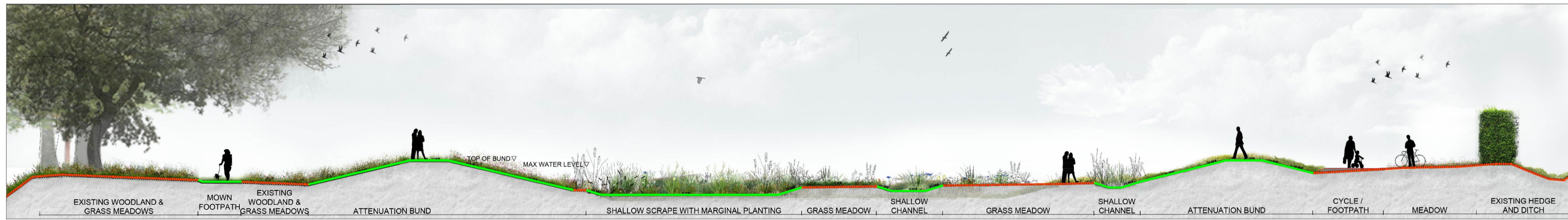
03 SECTION VIEW OF MOUND 501 PLAN VIEW