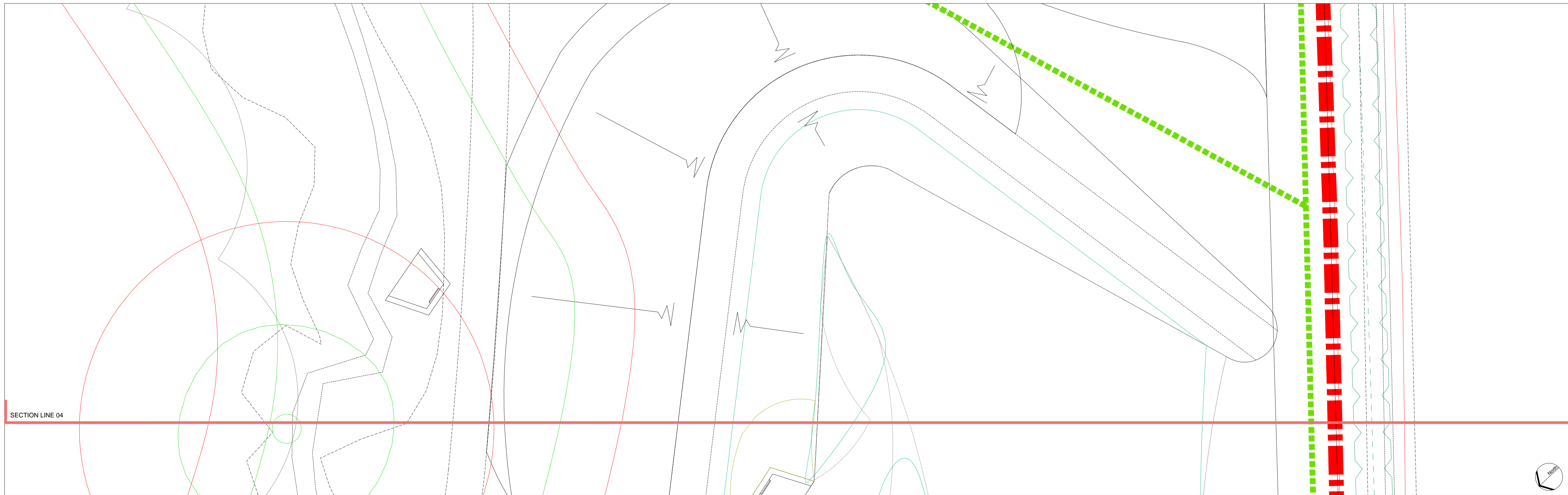
04 504 PLAN VIEW OF MOUND PLAN VIEW

No dimensions are to be scaled from this drawing. All dimensions are to be checked on site. Area measurements for indicative purposes only.