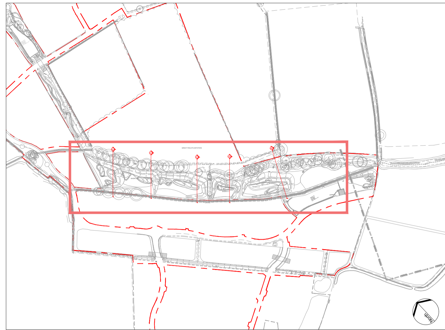
01 LOCATION PLAN 501 PLAN VIEW