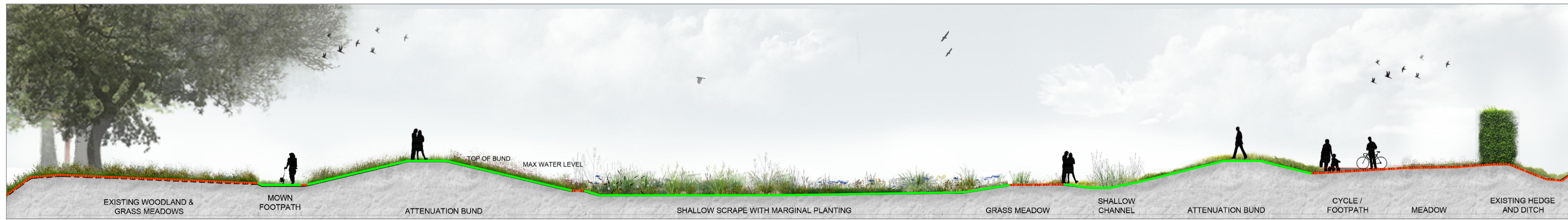
03 SECTION VIEW OF MOUND 501 PLAN VIEW