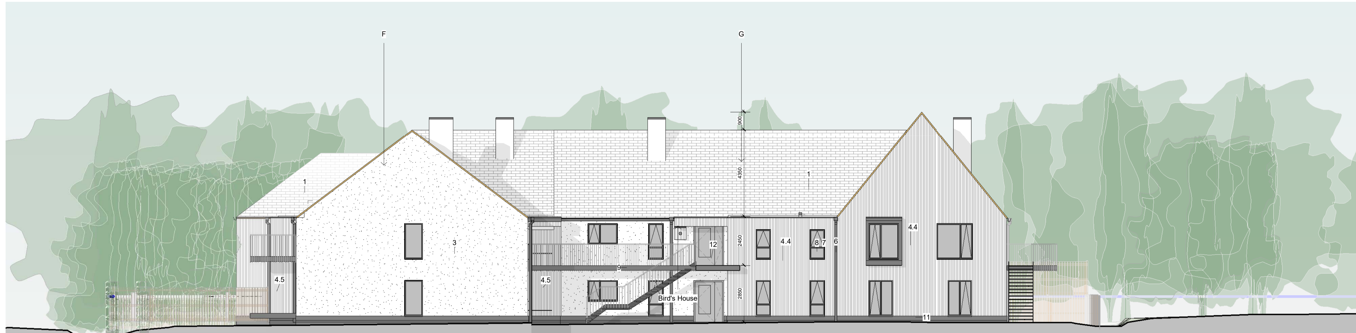
1 Elevations Blocks F G - East 1:100

This drawing is the copyright of the architect JBA. All dimensions and conditions to be verified on site by the relevant Contractor prior to proceeding. ... Standard industry solutions apply unless otherwise stated. All dimensions are in millimeters and are to structural faces or centres unless otherwise stated. not to finishes unless otherwise stated. Survey by others. This drawing must be read in conjunction with all other relevant drawings and specifications from the Architect and other consultants. If in doubt, ask.