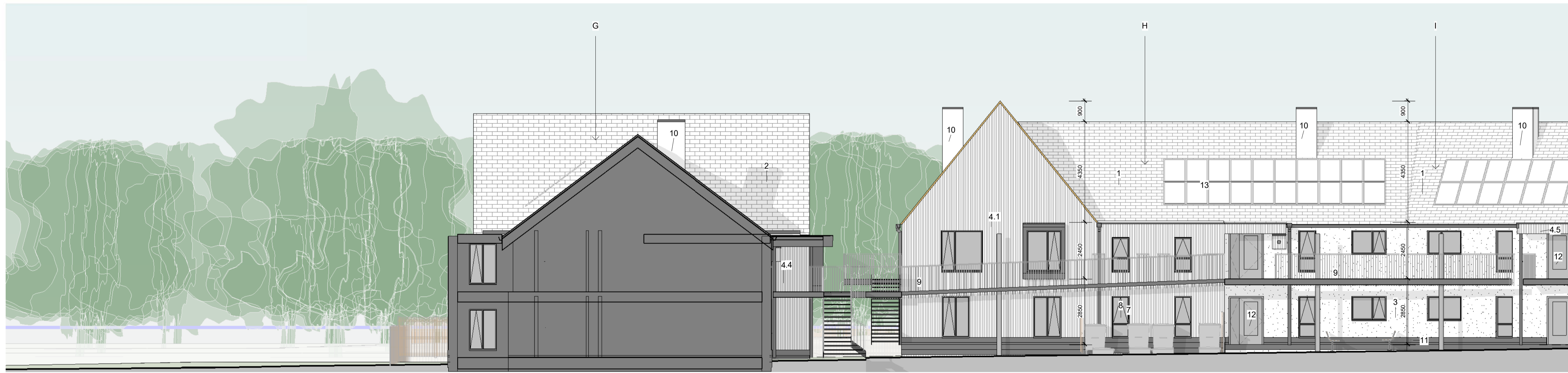
2 Elevations Blocks G H - North 1:100