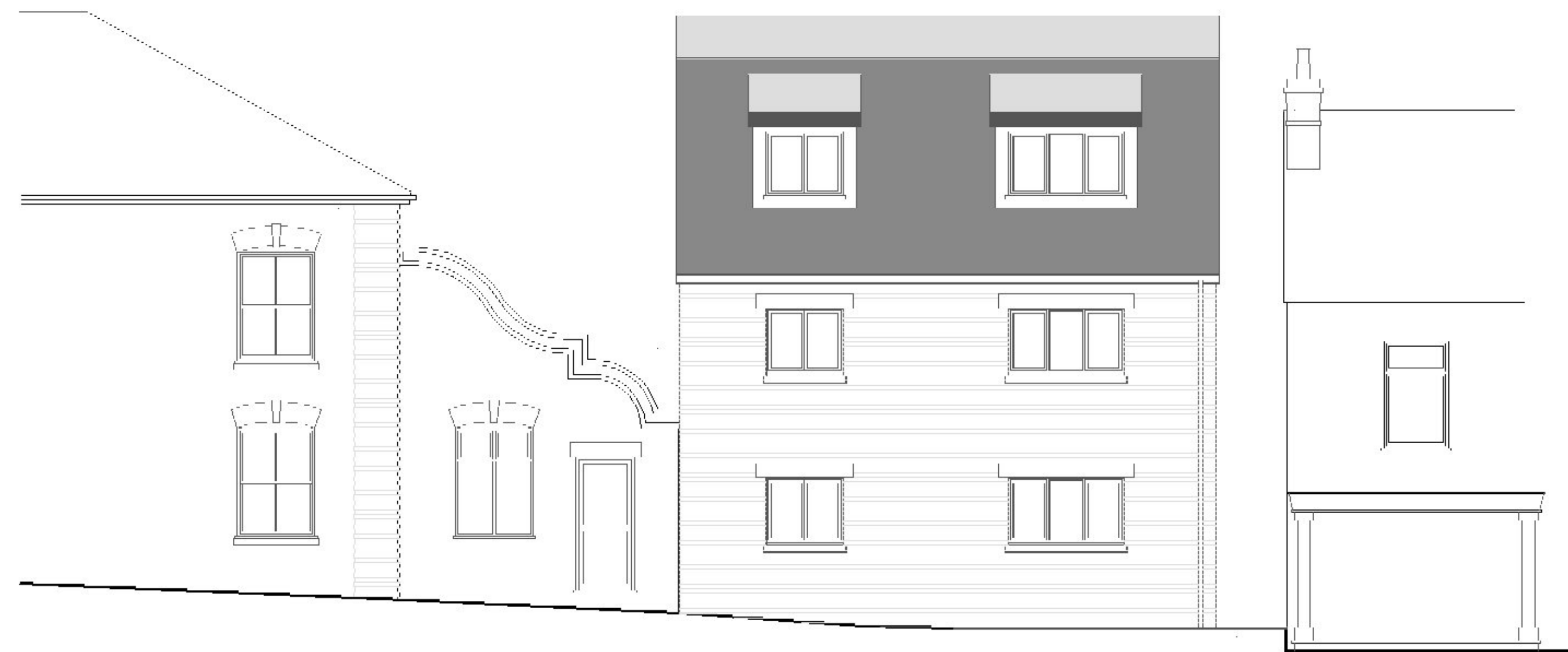
Front elevation facing Station Road