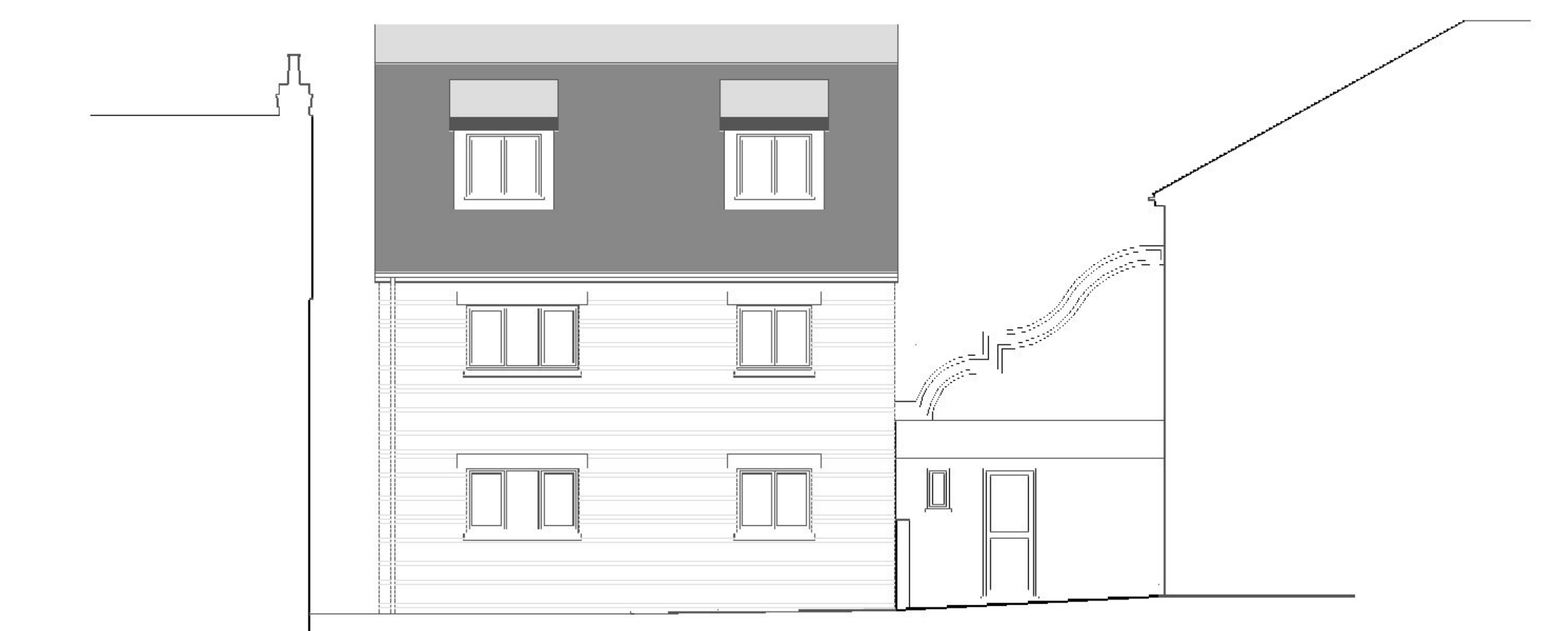
Rear elevation facing pay parking area