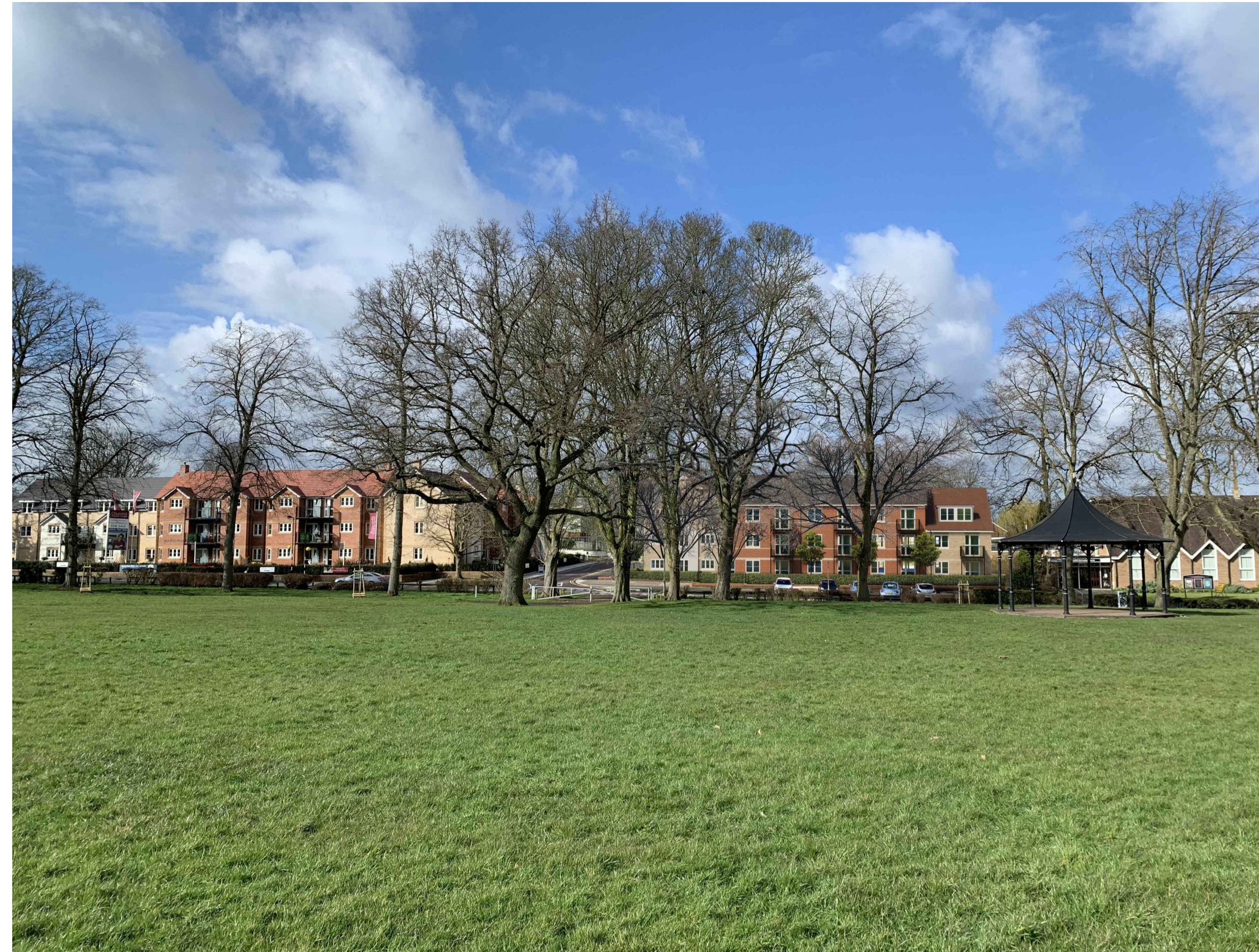
CGI view looking north towards the application site from the park