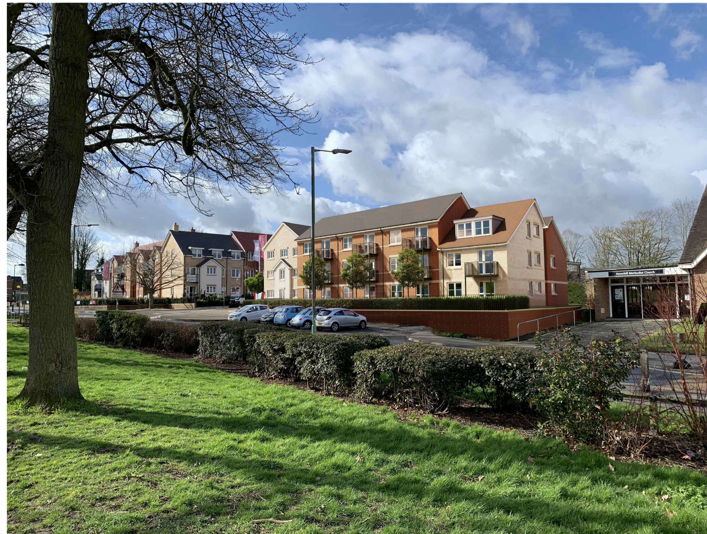
CGI view from the park across Camps Road toward towards the application site