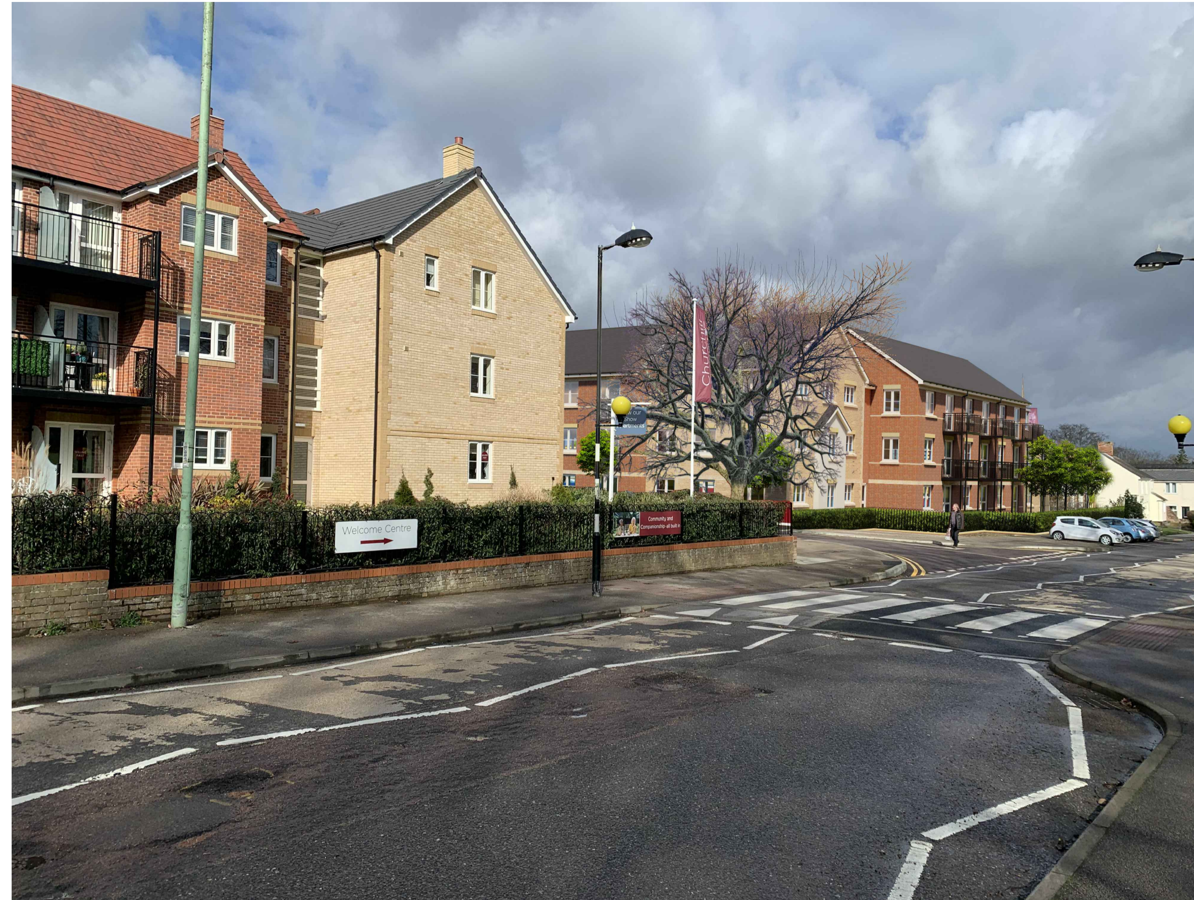
CGI view looking east along Camps Road towards the application site