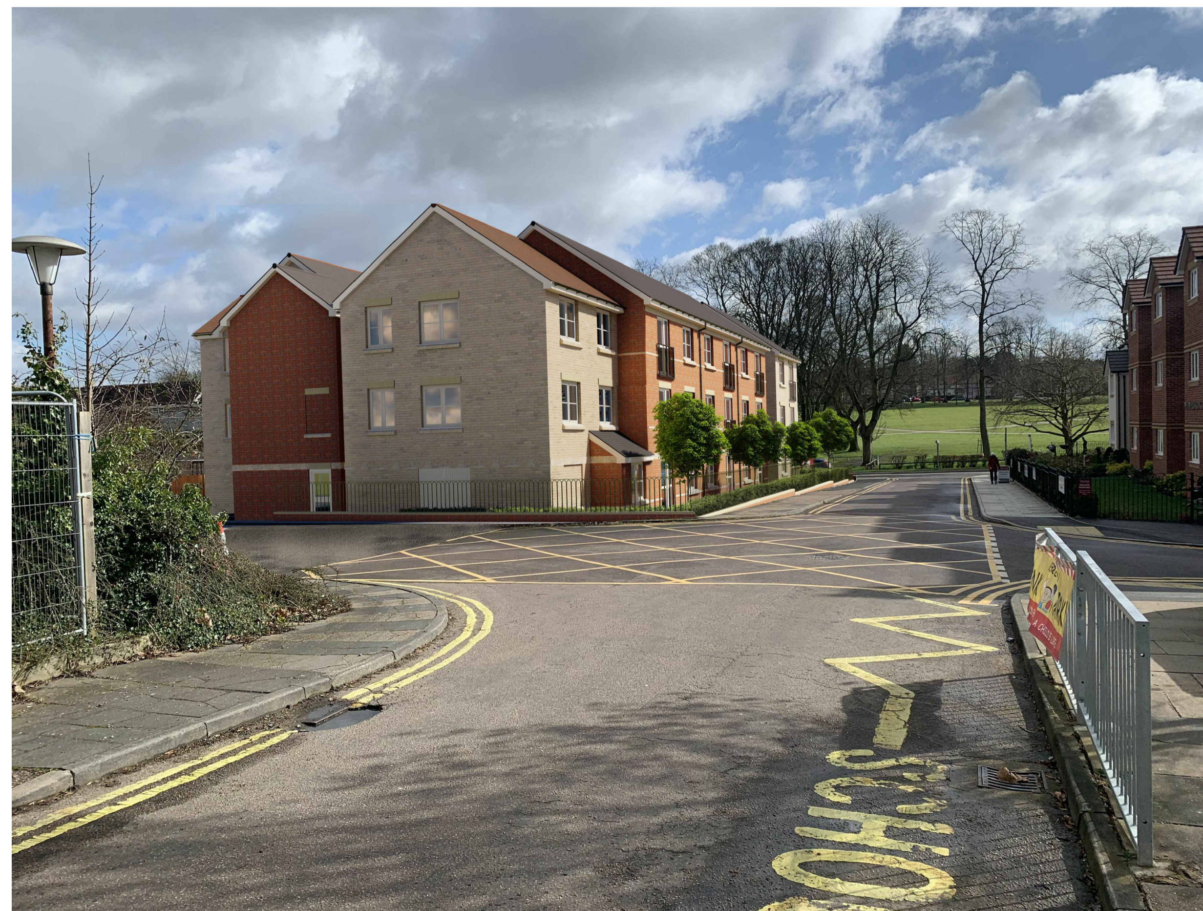
View looking south along the access road toward towards the application site.