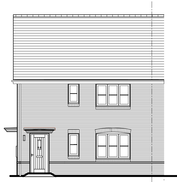
FRONT ELEVATION 1:100@A3