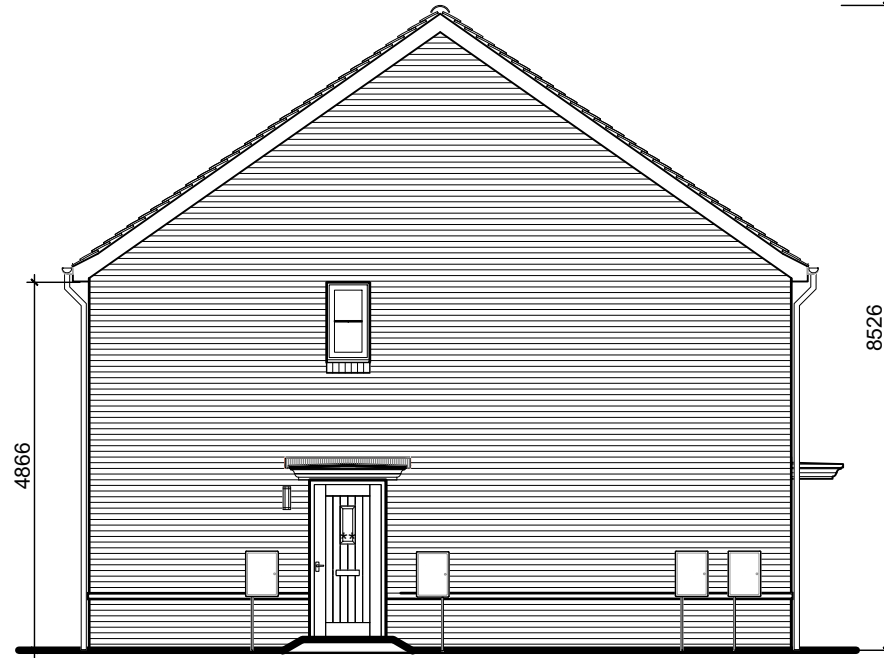
SIDE ELEVATION 1:100@A3