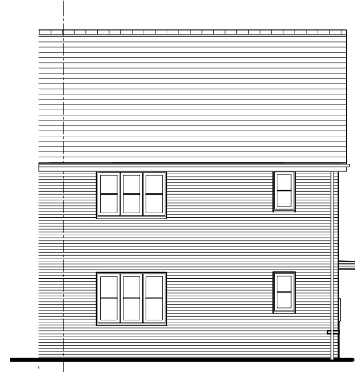
REAR ELEVATION 1:100@A3