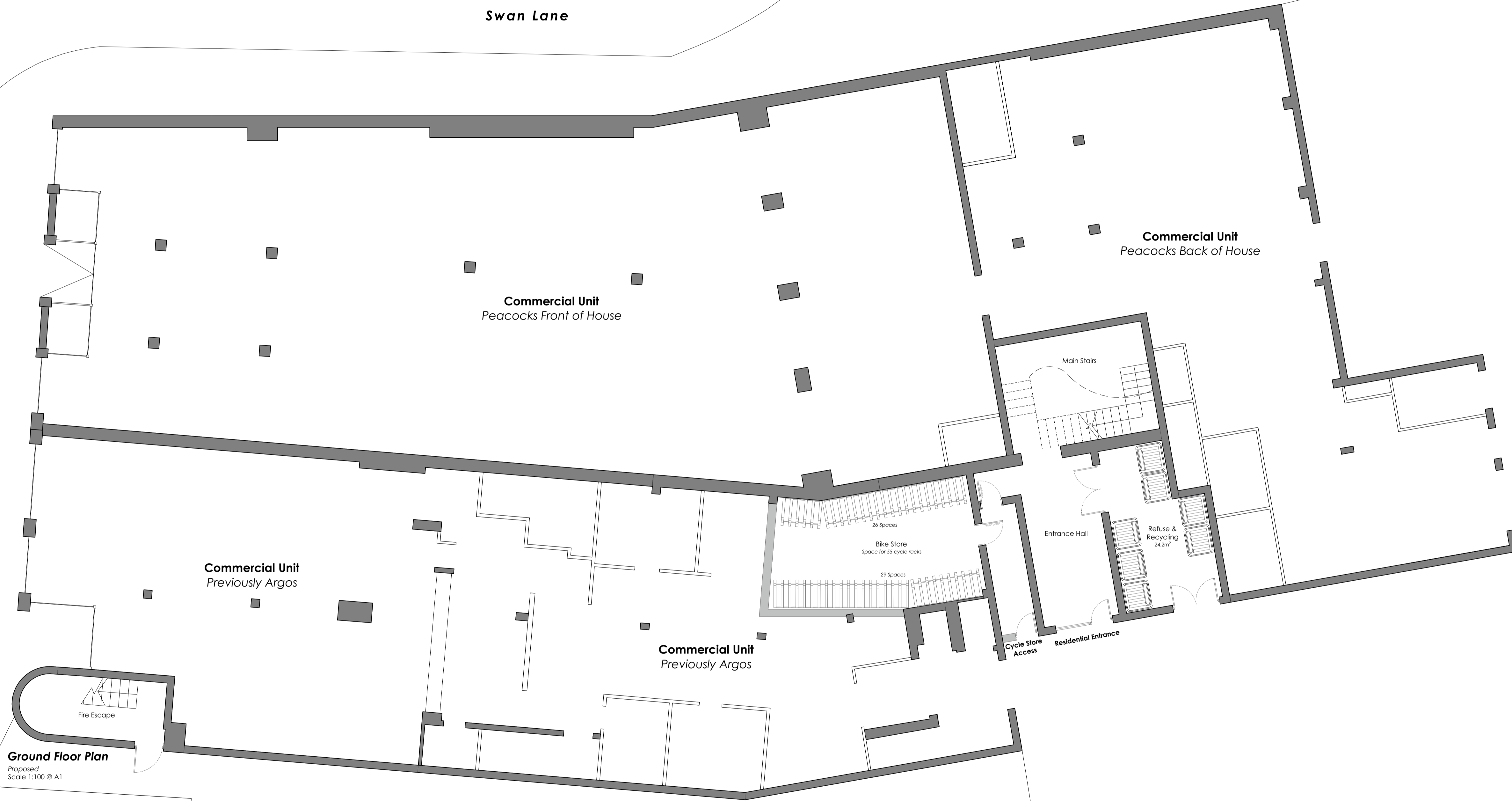
Ground Floor Plan Proposed Scale 1:100 @ A1