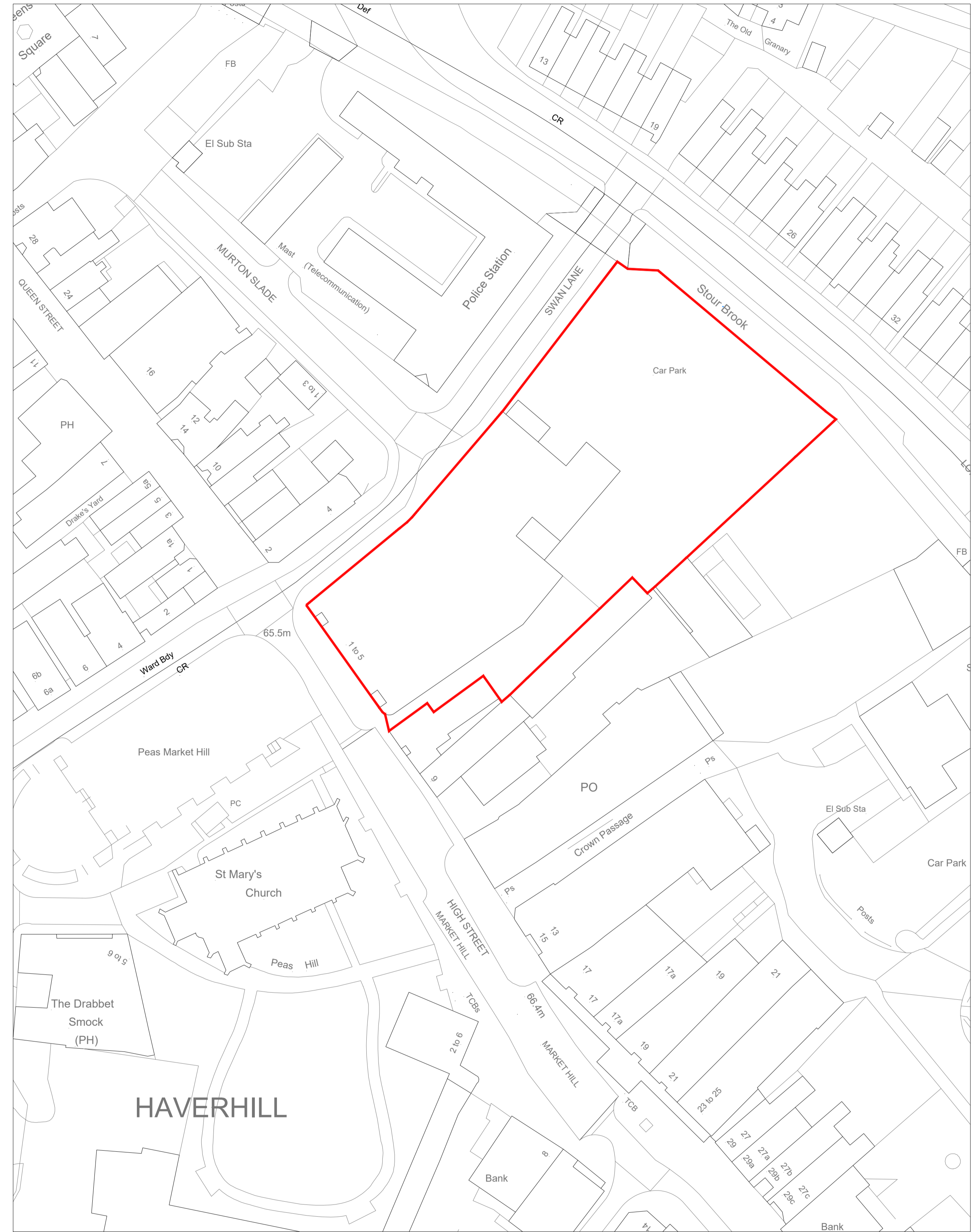
02 Site Location Plan 1:500 @ A1 / 1:1000 @ A3

DISCLAIMER: All dimensions are in millimetres. Do not scale from this drawing. All dimensions and conditions are to be checked and confirmed on site by the contractor. The contractor should inform the Architect of any discrepancies before proceeding with the work. This drawing is to be read in conjunction with all other relevant documentation including that produced by other consultants, subcontractors and suppliers. All elements of work and materials are to comply with the Building Regulations, British Standards, good industry practice and the recommendations of material and component manufacturers. All products are to be suitable for their purpose. The contractor is to install all products where noted in accordance with manufacturers recommendations, specifications and inform the Architect of any discrepancies or changes in the specification before proceeding with the work. This drawing is the property of ARCHANAEM LTD. Copyright is reserved by them and the drawing is issued on the condition that it is not copied, reproduced, retained or disclosed to any unauthorised person or company, either wholly or in part, without written consent.