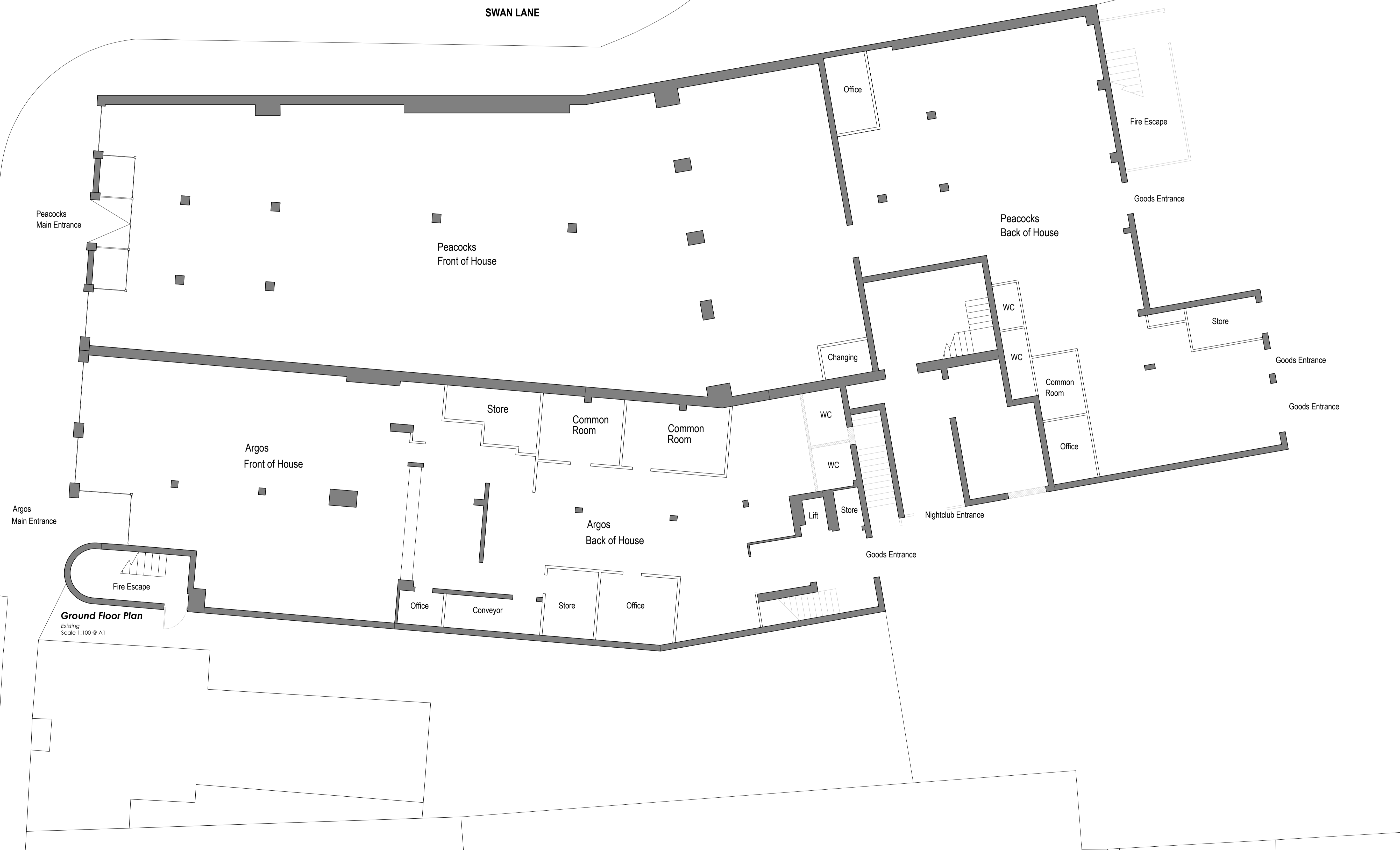
Ground Floor Plan Existing Scale 1:100 @ A1