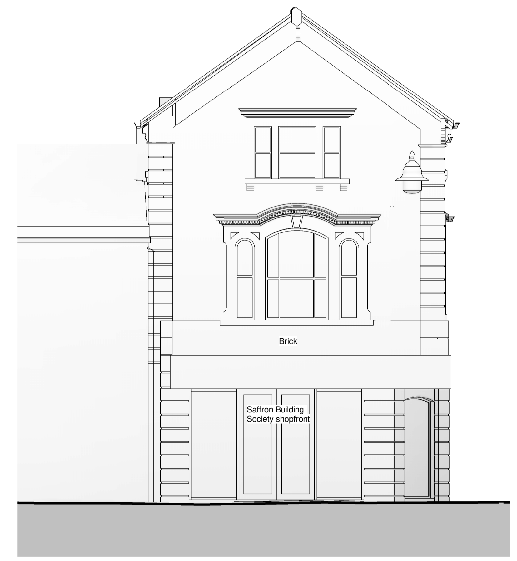
2 South Elevation (Queens Street) 1:50