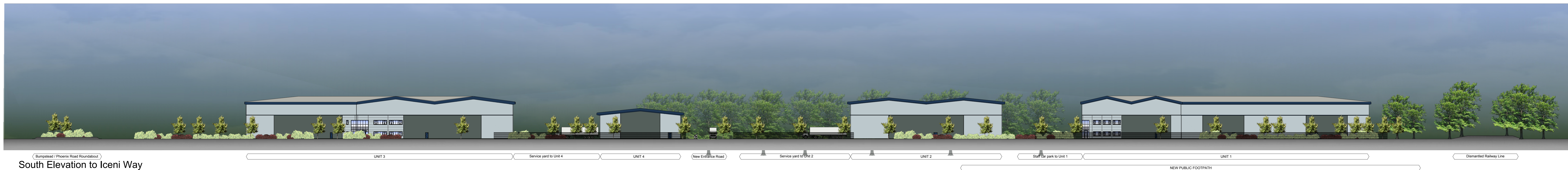
South Elevation to Icen Way