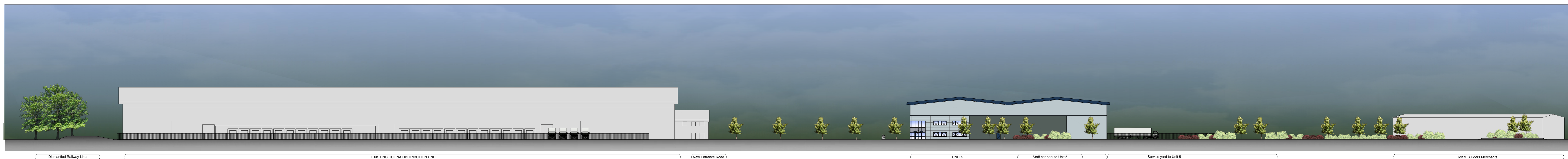
North Elevation to Icen Way