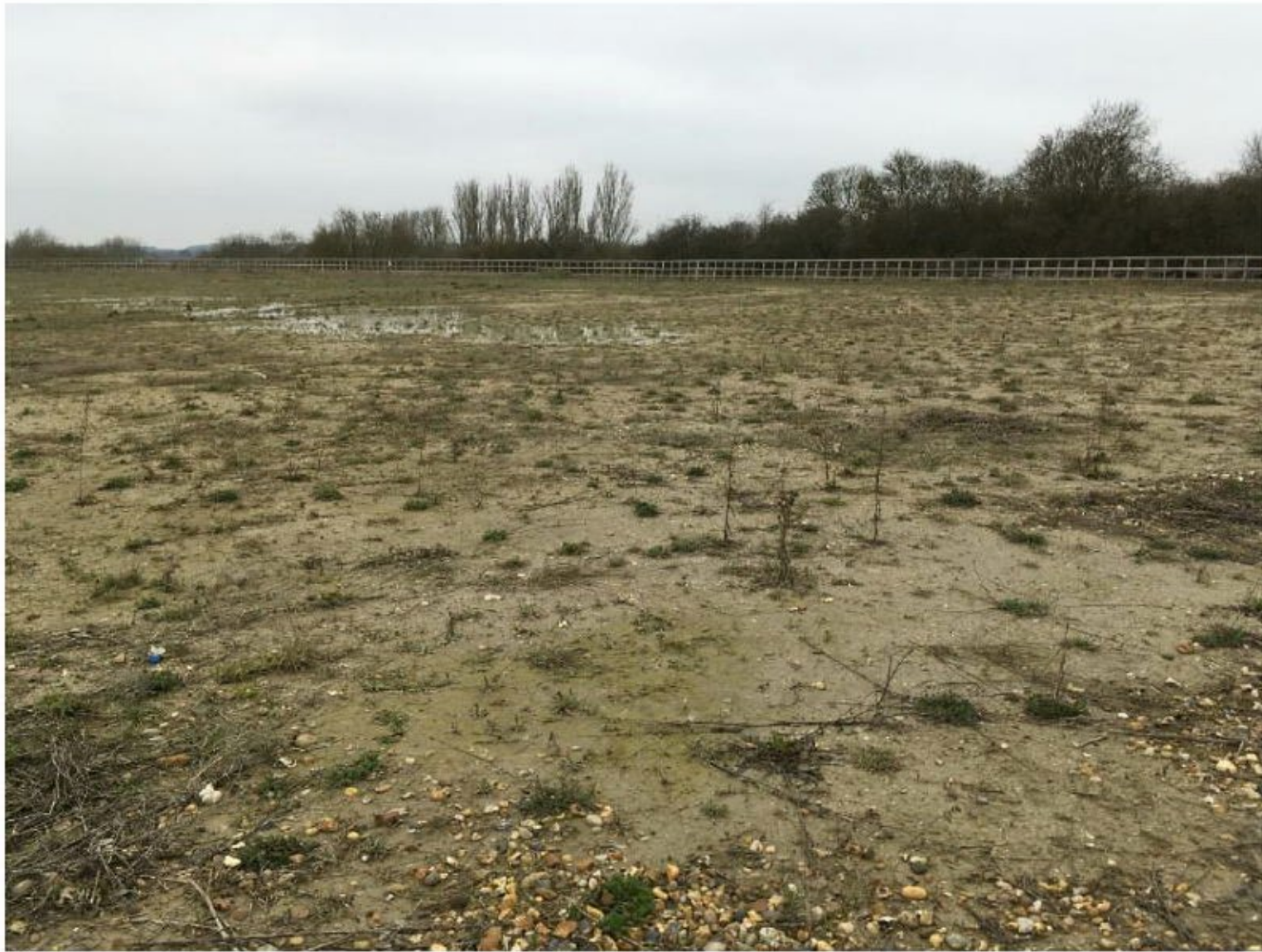
Photograph 1 – Bare ground north of Icen Way and woodland beyond