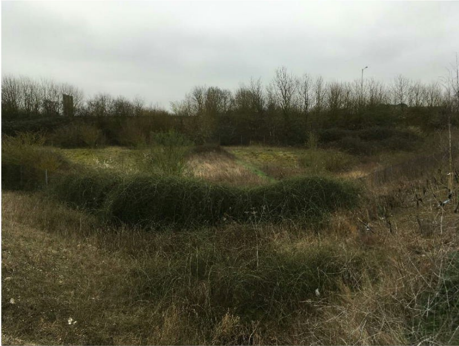
Photograph 3 – Flood attenuation feature adjacent to the south of the Site