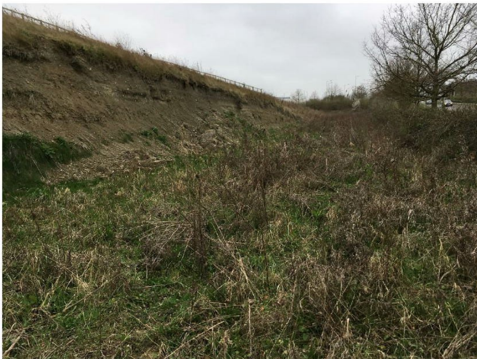
Photograph 6 – Earth bank created by slope failure