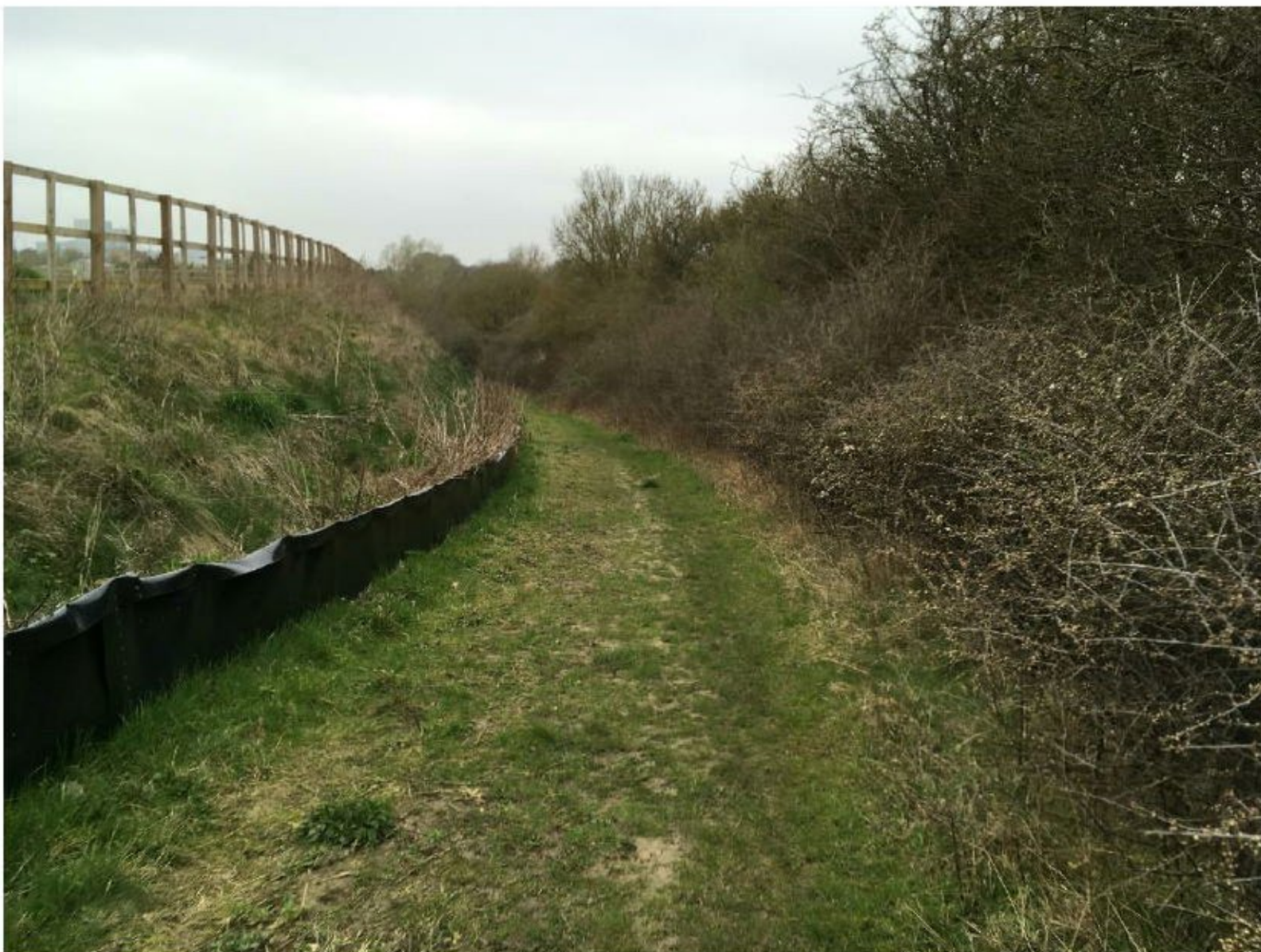
Photograph 4 – Reptile exclusion fencing adjacent to the north of the Site