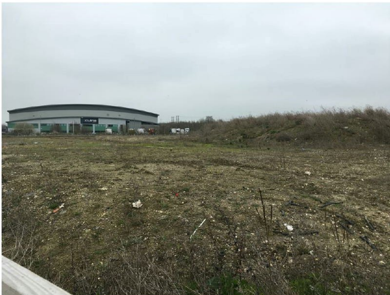
Photograph 2 – Bare ground south of Icen Way