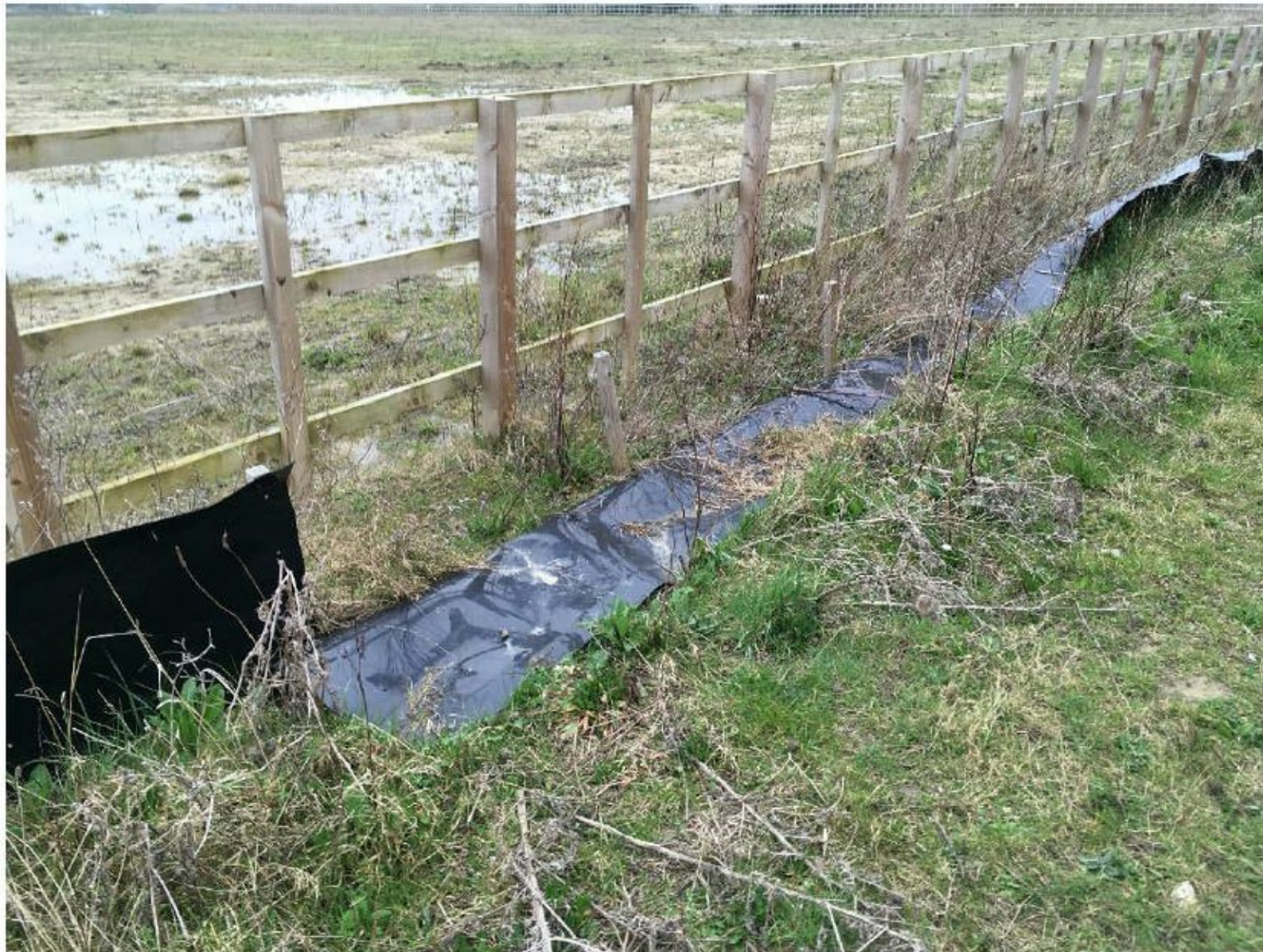
Photograph 5 – Example of damage to reptile fencing