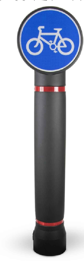
Bollard to indicate transition to cycleway Scale:NTS