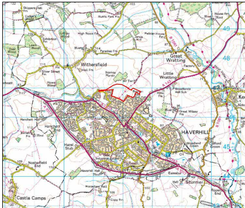
Figure 1: Site Location (Reproduced from Magic maps data licence number 100059700)

A previous phase 1 habitat survey for the relief road was undertaken in 2018, which noted the site as a series of arable and tall ruderal fields with managed hedgerows, scattered boundary trees, and wet and dry ditches. Additionally, in 2019, a preliminary ecological appraisal (PEA) for phases 2-6 was