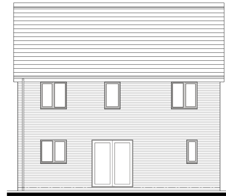
Rear Elevation