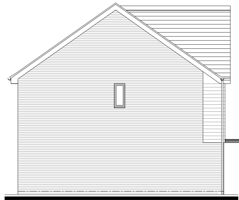
Side Elevation (AP) Right