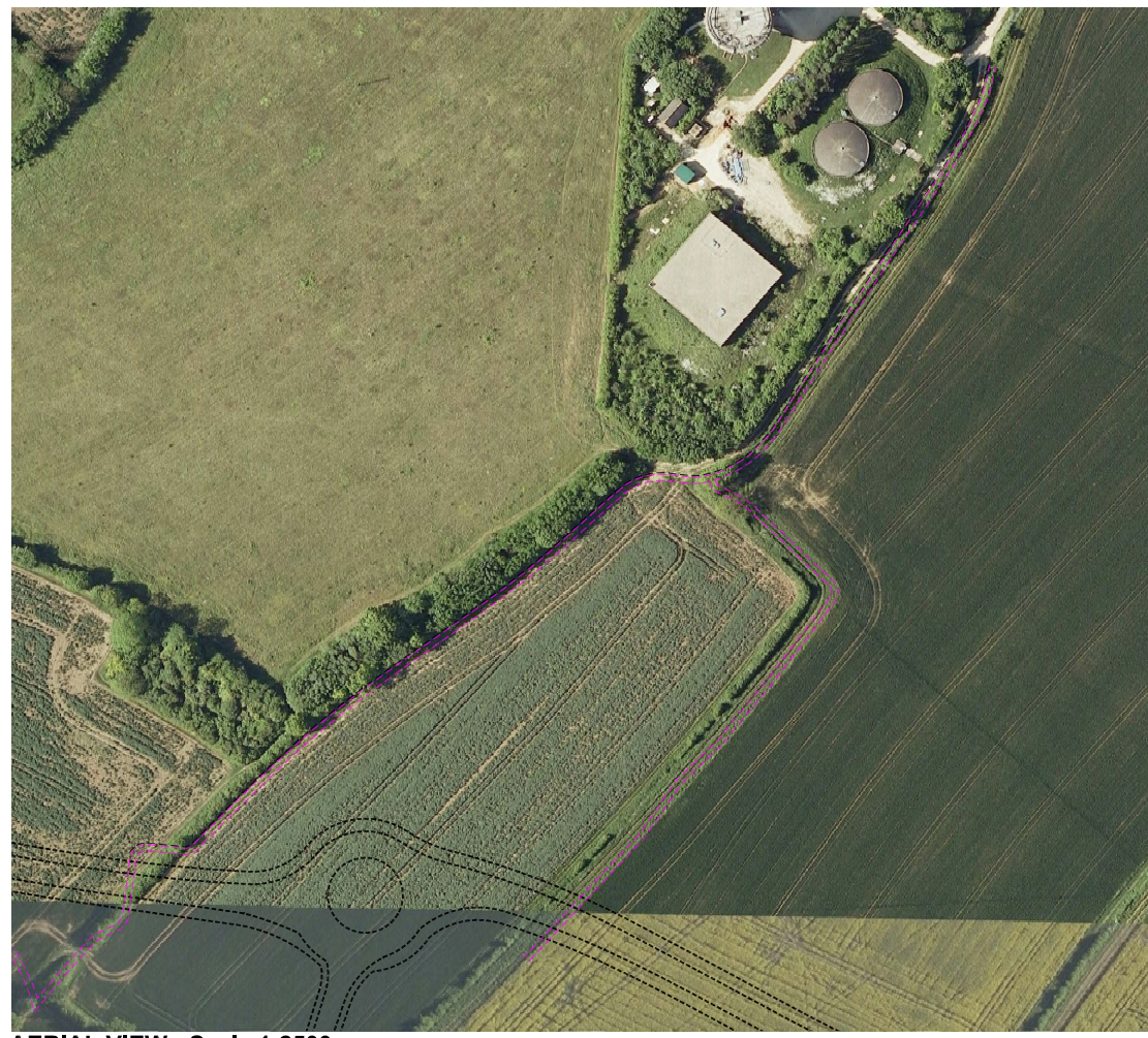
AERIAL VIEW - Scale 1:2500