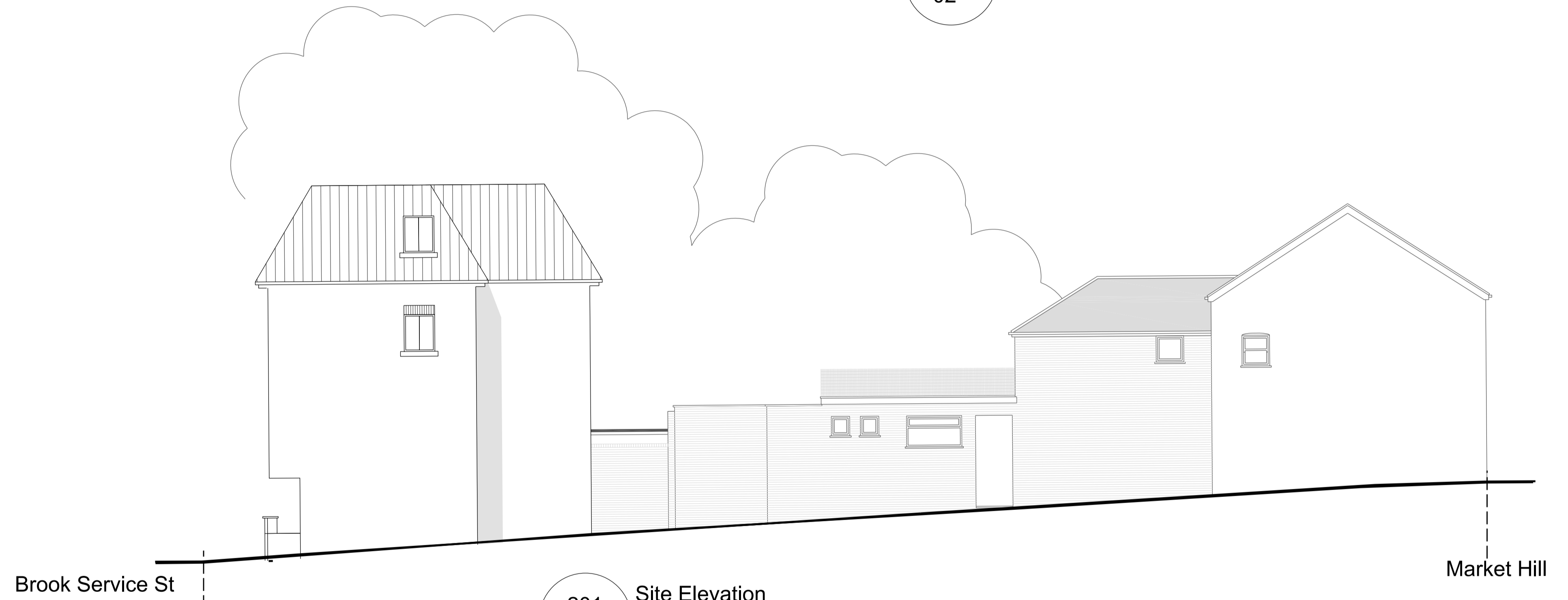
201 03 Site Elevation