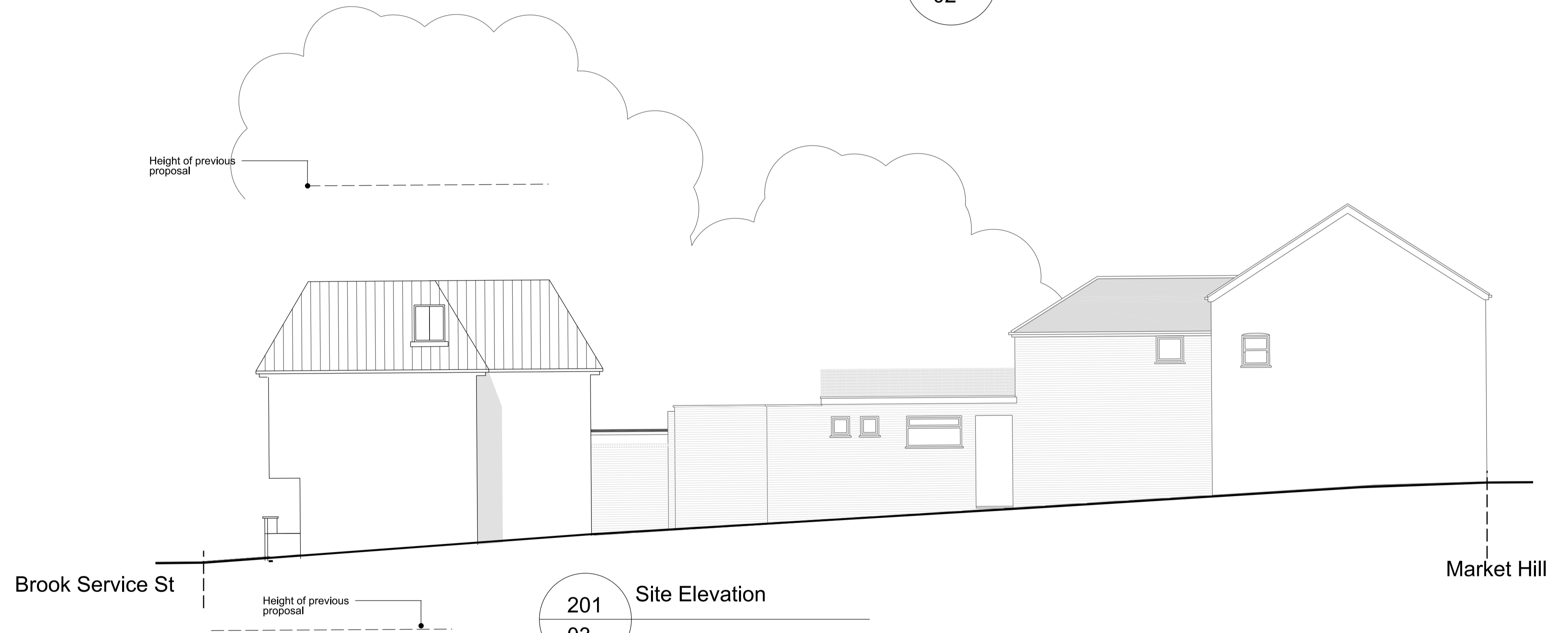
201 03 Site Elevation