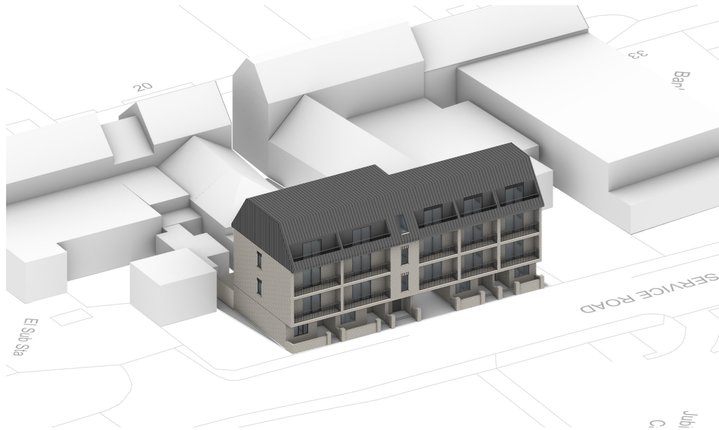
Initial Massing proposed - Dec. 2022