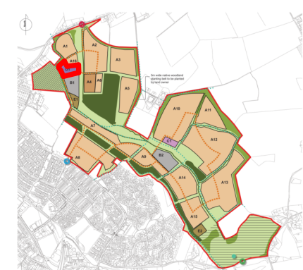
Parcel D1 as illustrated on: 5055-ES-01 Land Use Parameter Plan - Rev O Outline Planning Permission (Reference DC/15/2151/OUT)