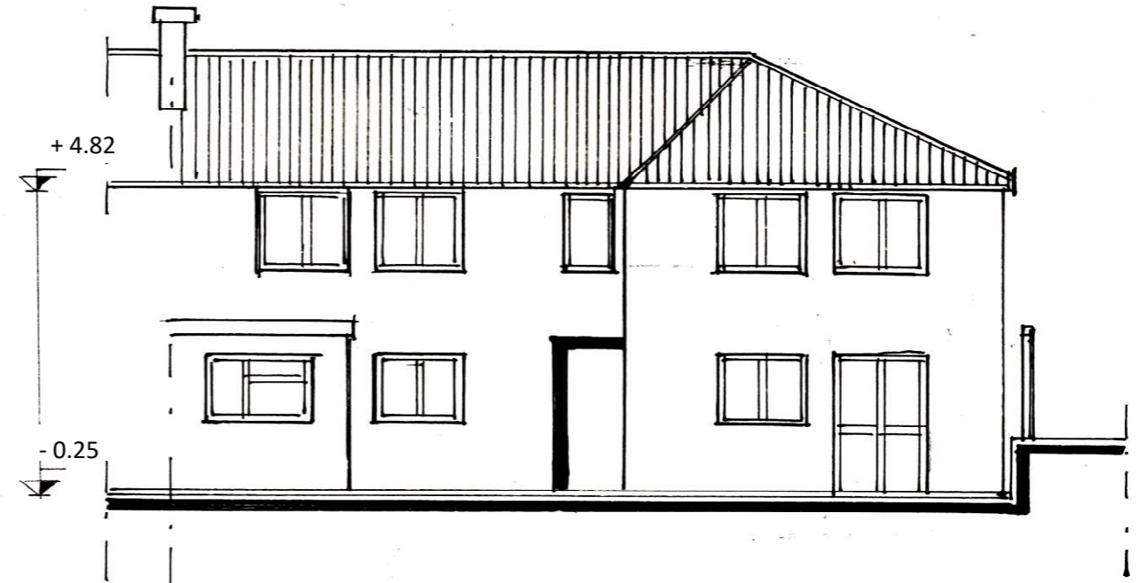
VIEW FROM THE REAR