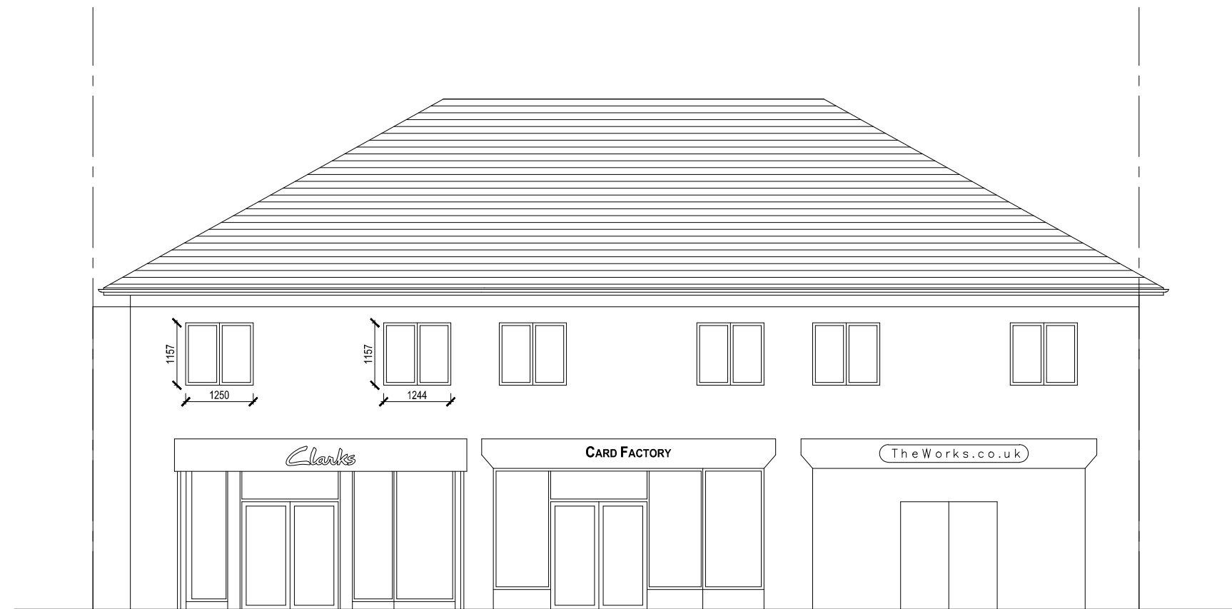
PROPOSED FRONT ELEVATION (AS EXISTING - UNCHANGED)

THIS DRAWING IS THE COPYRIGHT OF THE AGENT AND IT MUST NOT BE COPIED, AMENDED, EXTRACTED OR REPRODUCED WITHOUT WRITTEN CONSENT (UNLESS IF REPRODUCED FOR PRINTING, ELECTRONIC COPIES OR CONSULTATION PURPOSES BY THE RELEVANT AUTHORITIES).