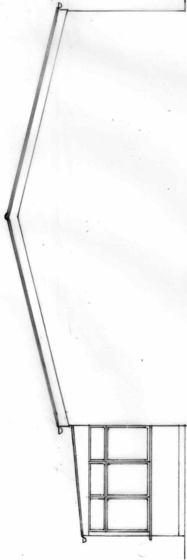
SIDE ELEVATION AS EXISTING