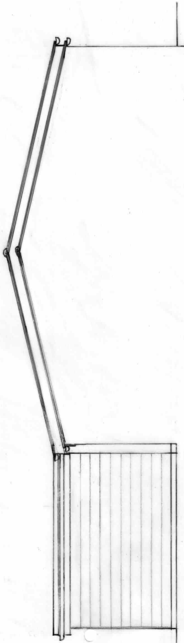
SIDE ELEVATION AS PROPOSED

EAVES HEIGHT OF EXTENSION NOT TO EXCEED EAVES HEIGHT OF EXISTING HOUSE..