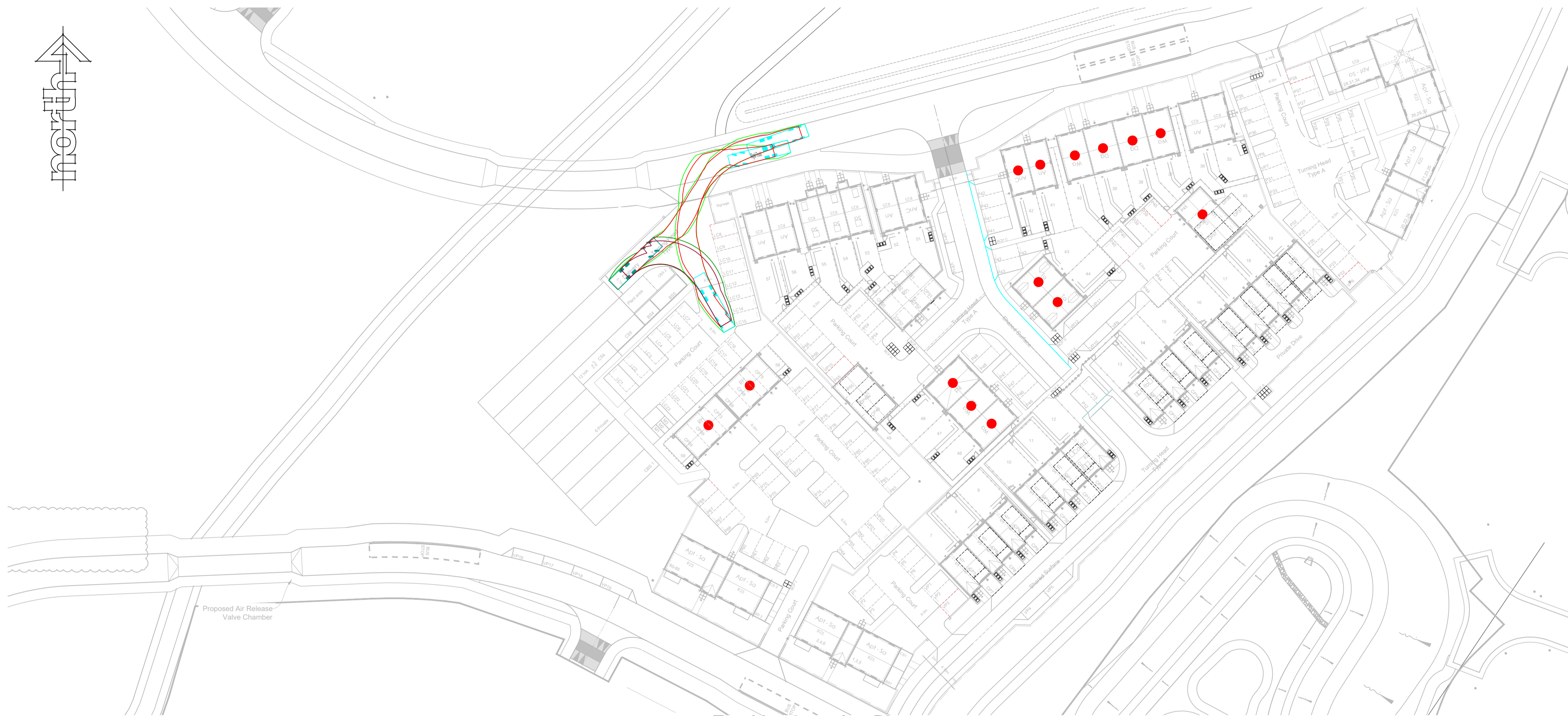
Tracking Location Plan Scale 1:500