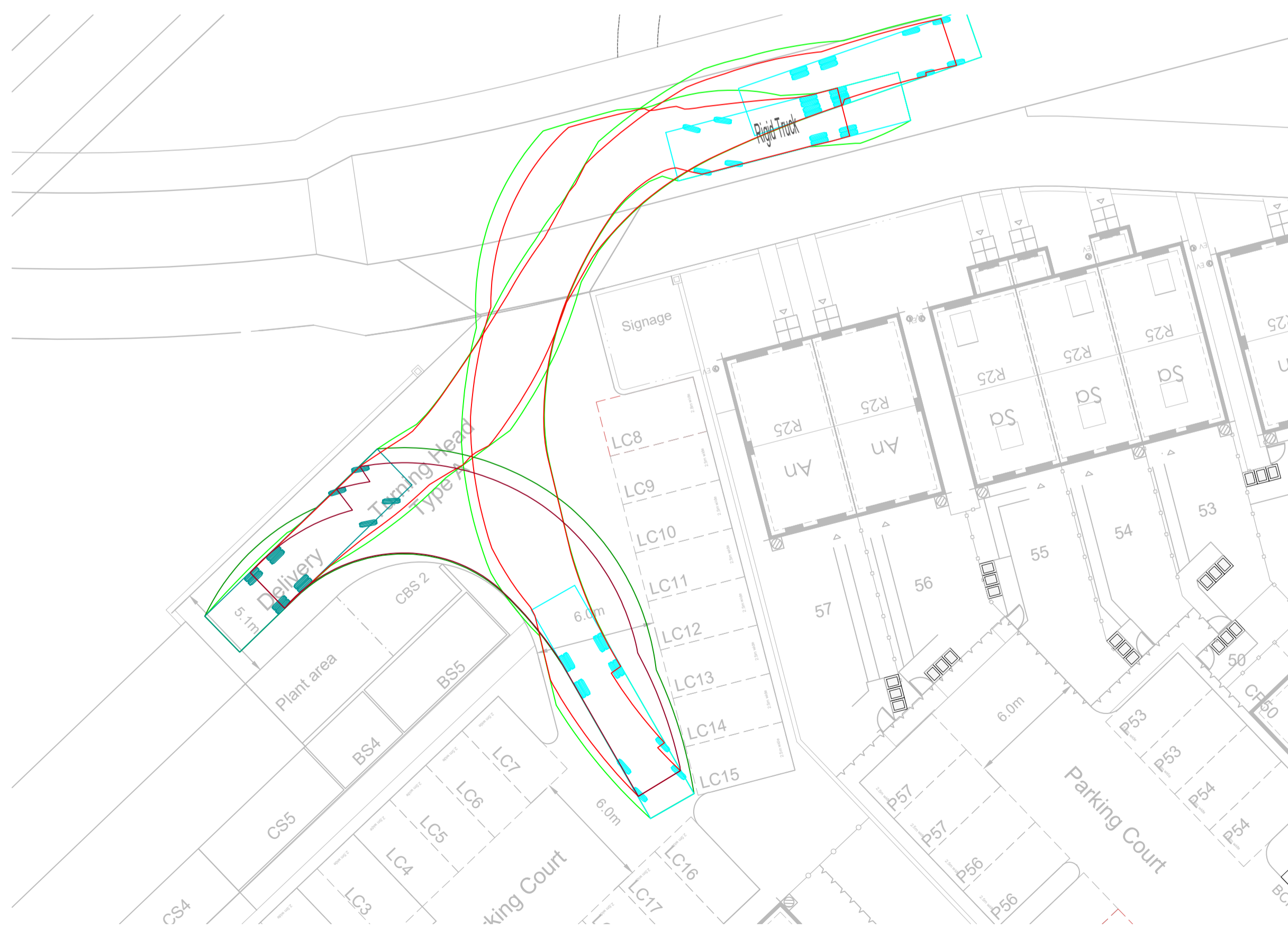
12m Rigid Delivery Lorry Tracking Plan Scale: 1:200