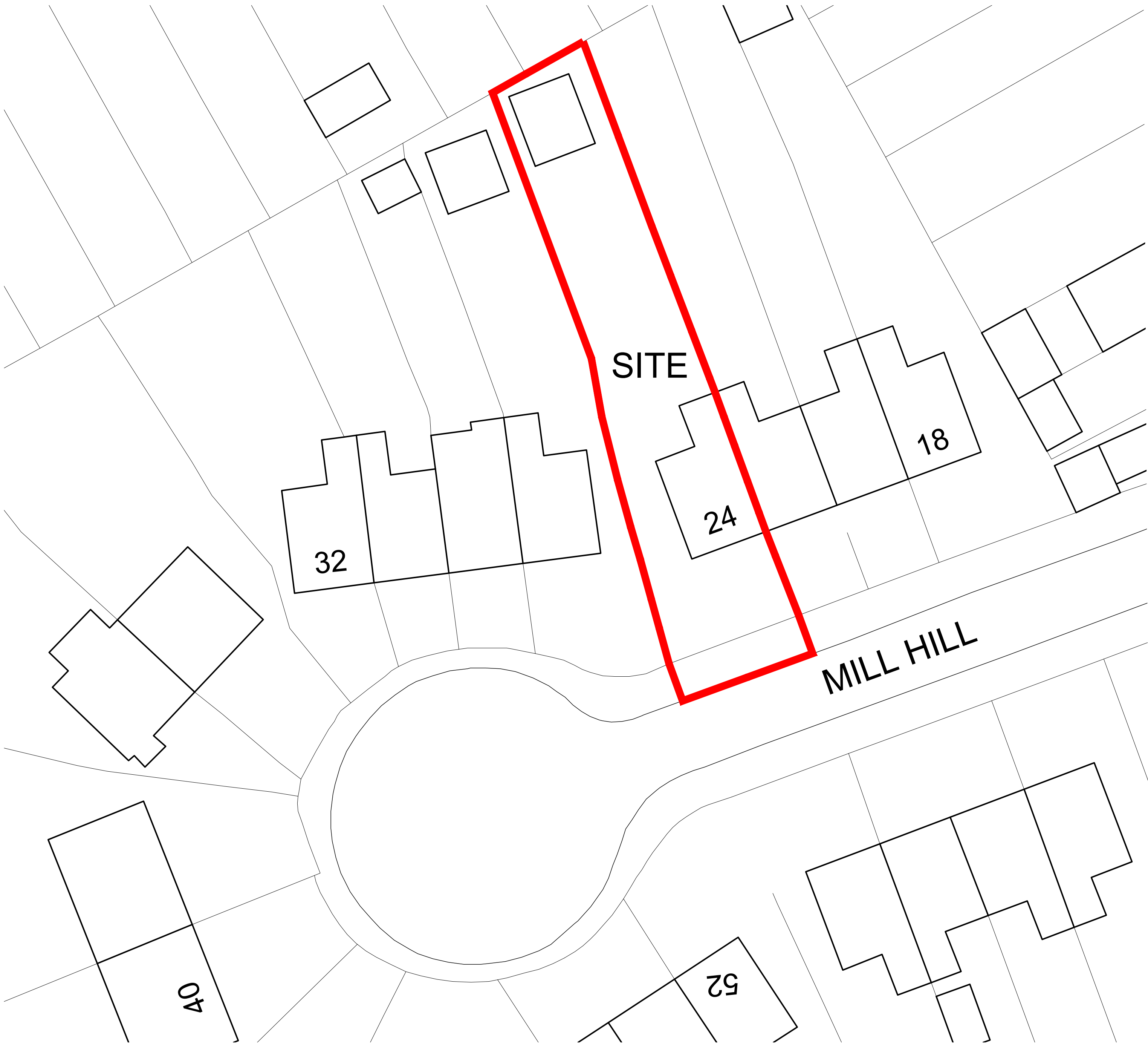
N Site Plan - As Existing 1:200