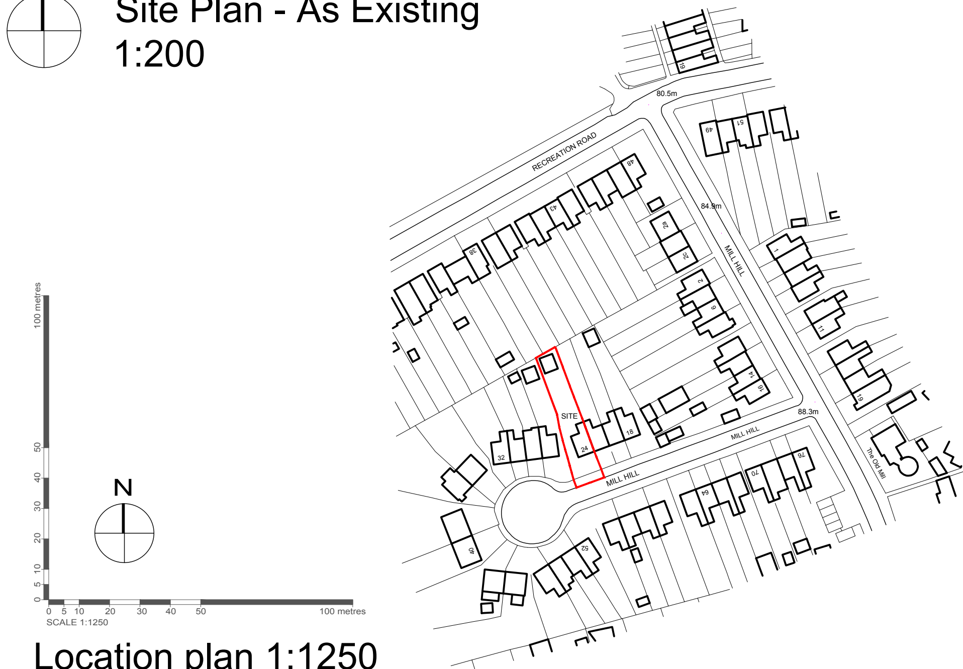
Location plan 1:1250