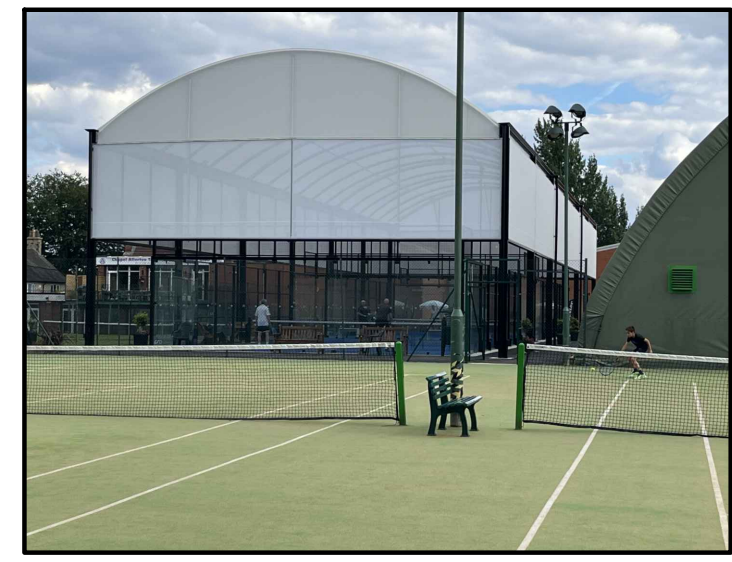
photo 2 - typical canopy over Padel Courts