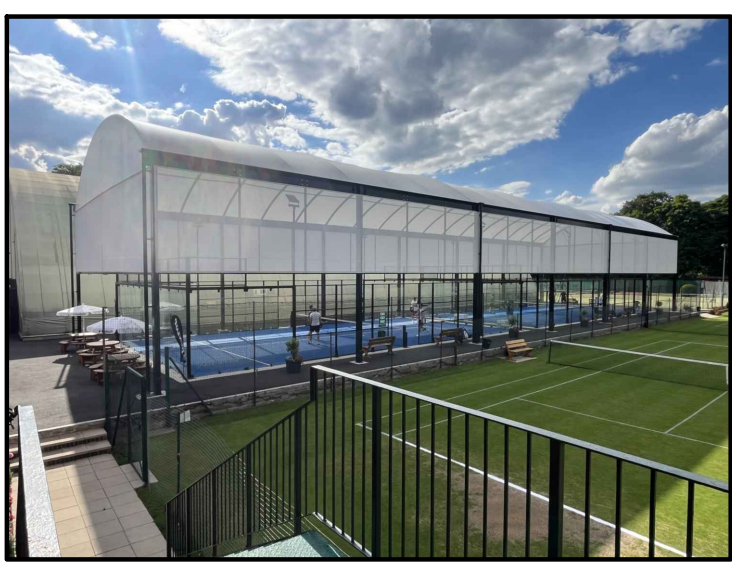
photo 1 - typical canopy over Padel Courts